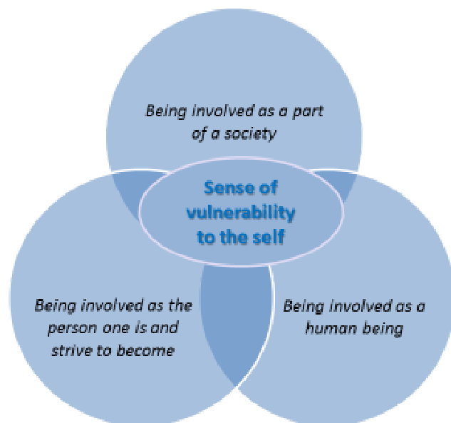
Figure 1. Core themes of residents perspectives of maintaining dignity