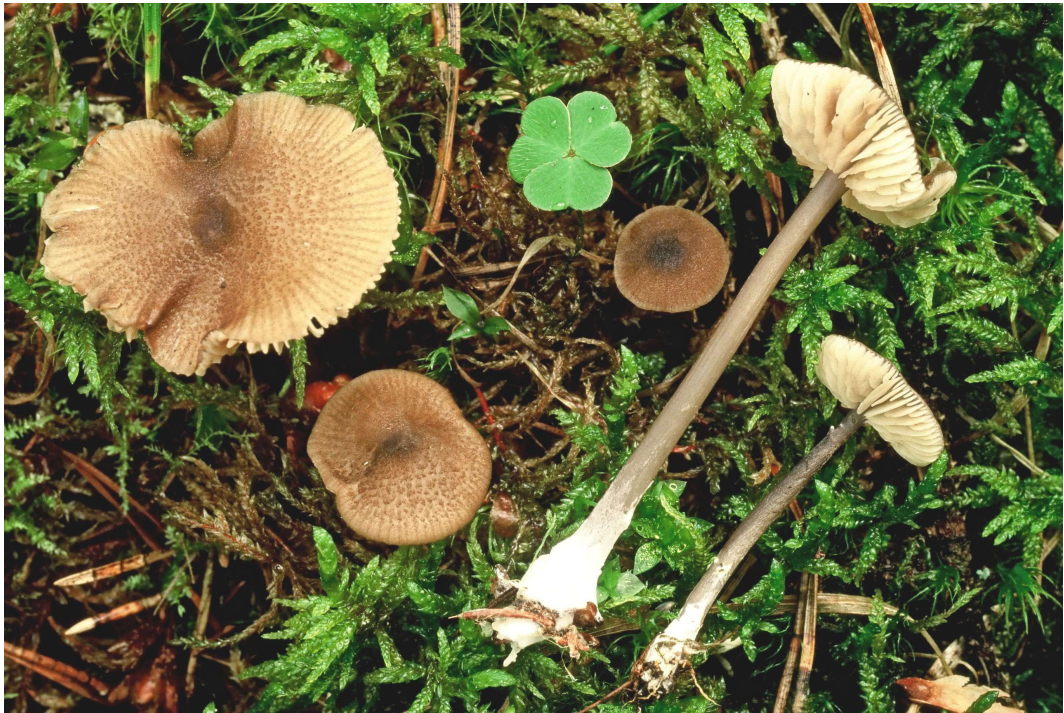
Figure 4 and 5. The stipe is originally described with a “delicately violaceous” stipe, “palescent with age”. Photos showing clearly conifer needles in the habitat.