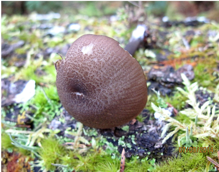
Figure 1. Entoloma fulvoviolaceum is recognized by the brown, faintly to distinctly translucently striate and pronouncedly squamulose pileus, denser towards the darker center (JL 109-2014).

calcareous water from the hillsides fertilizes the soil continuously. This process is by all accounts essential to the occurrence and distribution of most Entoloma species in the nature reserve (Lorås and Eidissen 2011).