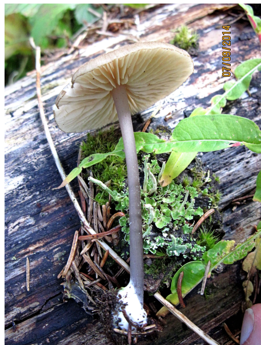
Figure 7. This specimen of Entoloma fulvoviolaceum has a light blue stipe, rather different from a violaceous color (JL 103-2014).