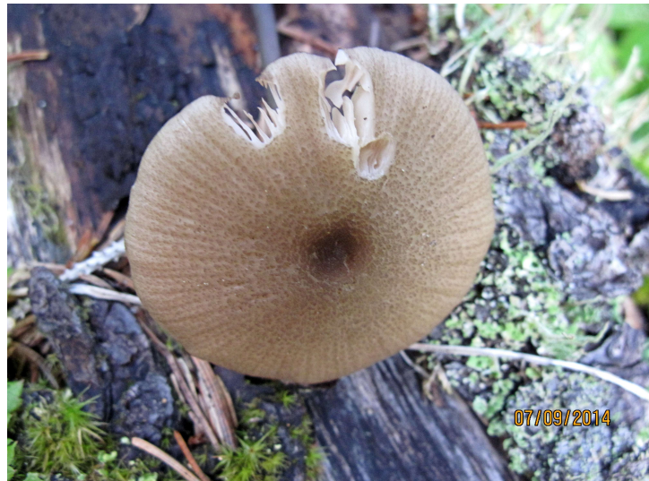
Figure 2. Entoloma fulvoviolaceum with a pale brown pileus and some darker center (JL 103-2014).

ITS region of seven of these collections were sequenced by Pablo Alvarado Garcia at ALVALAB. Four of them failed in obtaining