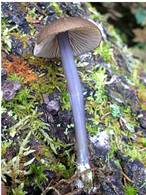
Figure 6. In spite of the original descriptions of Entoloma fulvoviolaceum saying "delicately violaceous" stipe color, our finds varied from dark to light blue (JL 109-2014).

Originally, the spore size of E. fulvoviolaceum is reported as 8.5-11.0(-11.5) x 6.0-8.0 (-8.5) \mu\text{m} , with Q_{av} = 1.3-1.6 . Table 1 indicates that it is a larger size variation than given, and we also found that the paratype we received from Vauras had larger spores than given in the original description. In