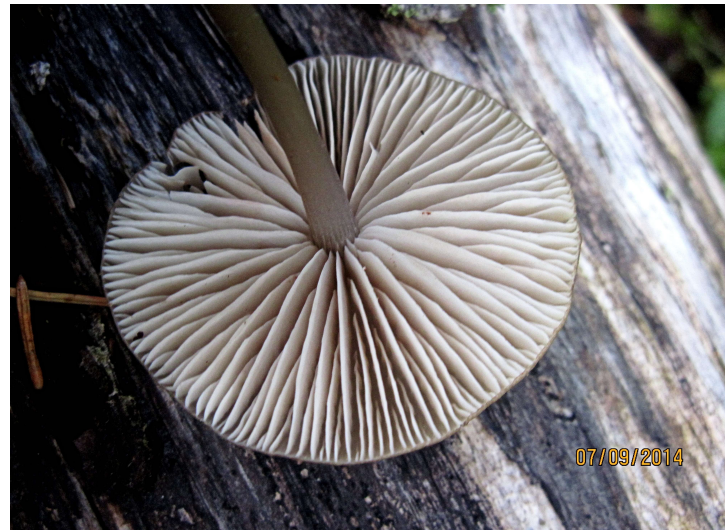
Figure 3. Lamellae of Entoloma fulvoviolaceum are pale, cream-colored, and with concolorous edge (JL 103-2014).

The stipe is originally described with a “delicately violaceous” stipe, “palescent with age” (Noordeloos 2004). No developmental stages of carpophors from Holmvassdalen demonstrated violaceous colours. According to Vauras the violaceous stipe colour shown in Noordeloos (2004) is too strong (pers. comm.). This is also seen in the received pictures (Figs. 4 and 5). The stipe colour in our finds varied from dark to light blue, independent of age (Figs. 6 and 7). The pileus is originally described as “deep orange brown with darker