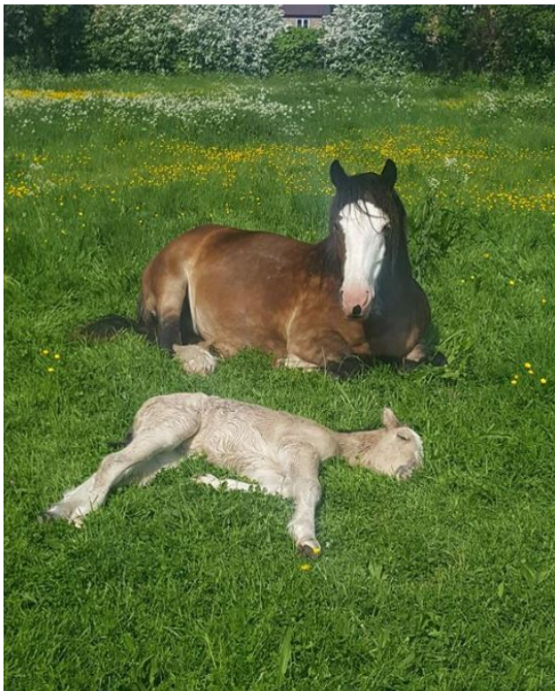
Plate 3: Content mare and foal in their home environment.