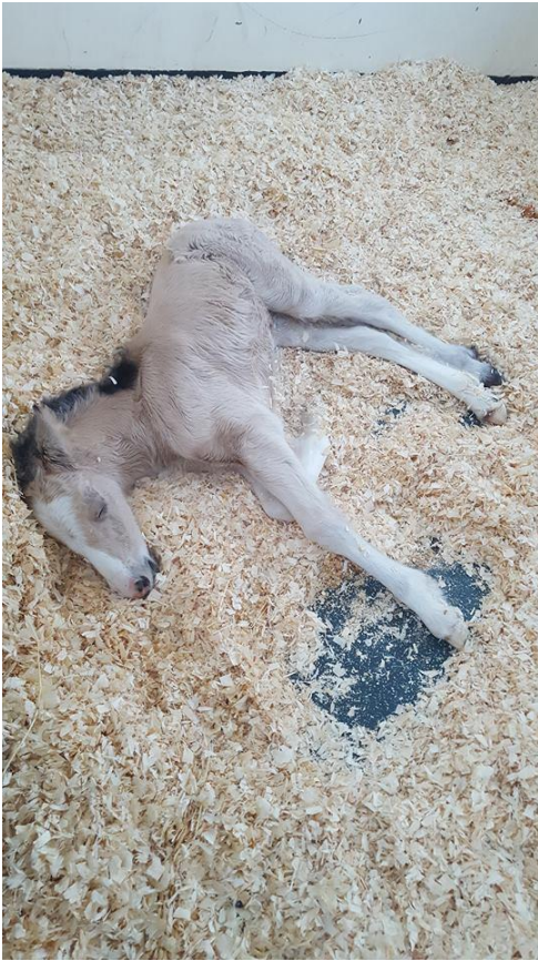
Plate 1: Relaxed foal following a well-managed separation from the mare.

issue. Such as, allowing the mare to sniff and touch the foal every time they enter the accommodation to carry out a nursing intervention.