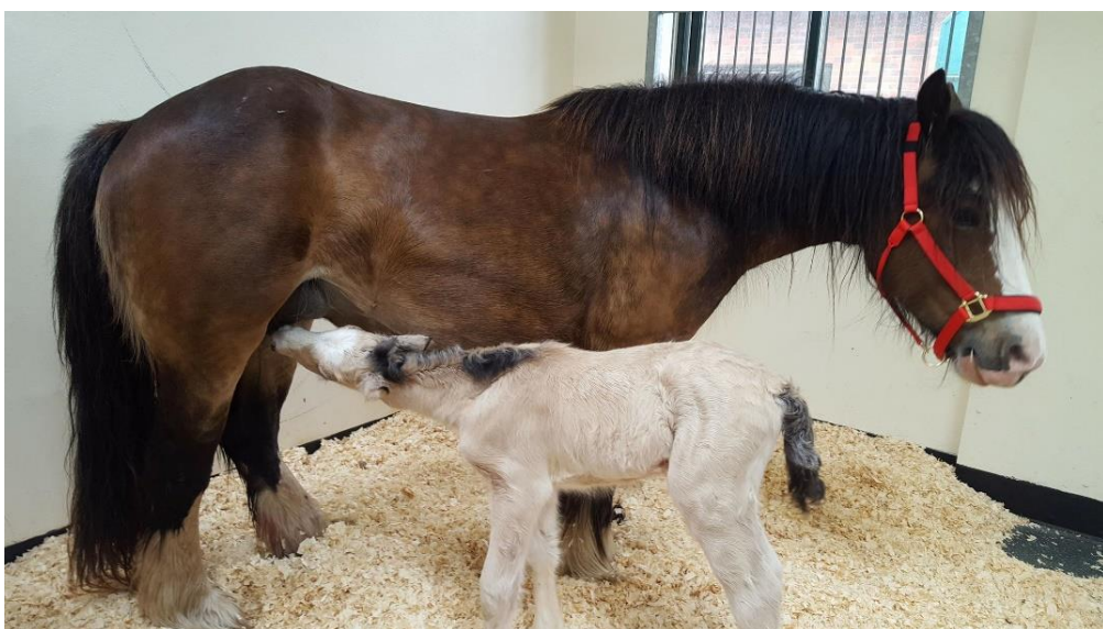
Plate 2: Foal nursing from mare in a hospital environment.