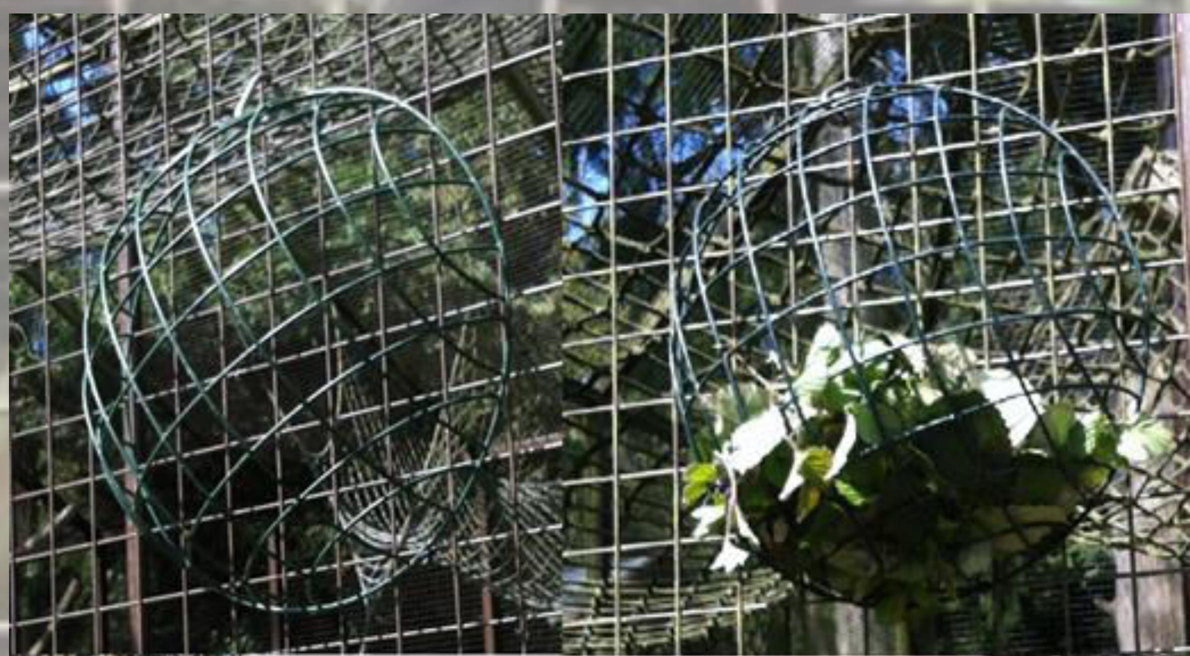
Figure 1: Browse presentation