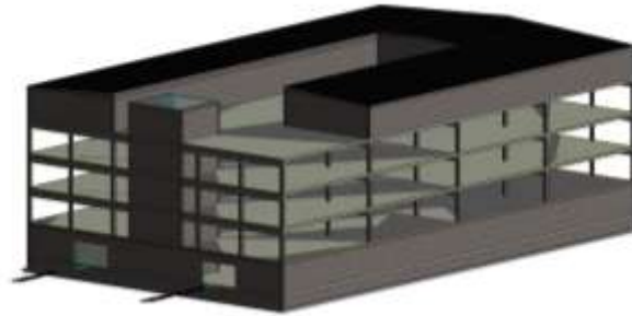
Figure 1. Example of a BIM model from a student project

The students perspective focuses on solving the project task in a best possible way. In a traditional course, managed by the lecturer, the constraint is clearly presented and the result is an exam with a fixed and predefined result. The project focuses on industrial buildings with high complexity related to structural framework, choice of material – and including sustainability as assessment criteria of designed solution. The BIM based software that has been used was Autodesk Revit Architecture. Example from a student project is illustrated in figure 1.