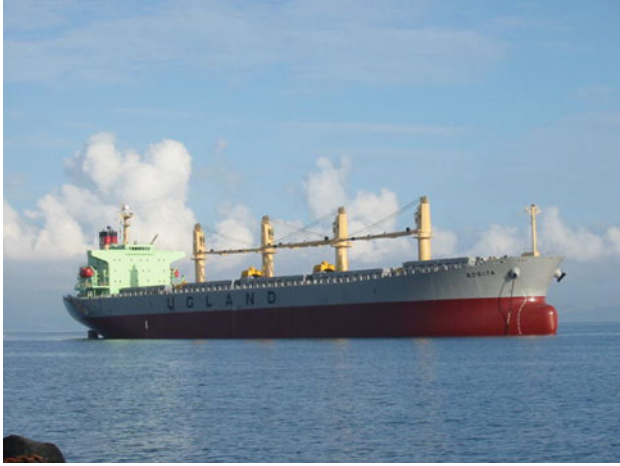
Fig. 3. M/V Rosita managed by Ugland Marine Services AS is a typical bulk carrier. The engine of 7.8 MW represents a large source of waste heat.