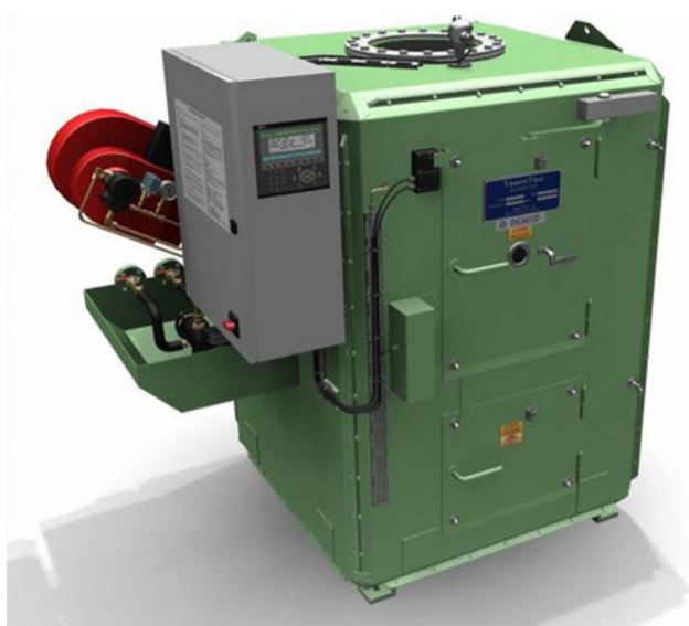
Fig. 2. TeamTec OG 200C incinerator, representing a waste heat source with high temperature.

boiler calls for additional safety measures and extra installation. However, an incinerator might be a good candidate for the introduction of TEGs. The incinerators have a high available temperature difference, and the general characteristics of the TEG comply with the design criteria given above for the incinerator. The capacity of an incinerator is normally matched with the bunker oil consumption of the main engine. Approximately 2% of the bunker oil is separated off as sludge. Of the sludge, 50% is drained off as free water, leaving a sludge containing about 25% water. The capacity of an incinerator should be 1.5% of the bunker oil consumption with an operating time of 50% (operation time could be