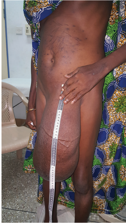
Fig. 1 Large inguinoscrotal hernia