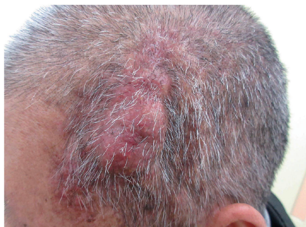
Figure1. Head mass