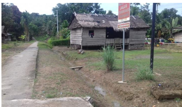
Figure 3. The settlement of trans migrants in Sipora

As mentioned in previous part, transmigration program has destroyed the forests as the food sources of indigenous people. It can be seen because the economic system in Mentawai remained slow since most indigenous people do not have money and they just depended on the food product they produce themselves. There is only few people can afford rice and chicken, because mostly they eat the food from forest (such as sago) and ocean (such as fish). Sago, as their main staple food is obtained from the sago pal, and it grows wild in their surroundings. Then they have root crops, bananas, and fruit trees (Persson, 1997). Rice is not a common part of Mentawai people's diet, because it is not cultivated in Mentawai. It has been imported from Padang, the capital city of West Sumatra. Rice is then, for the poorest people too expensive (Johansen, 2008).