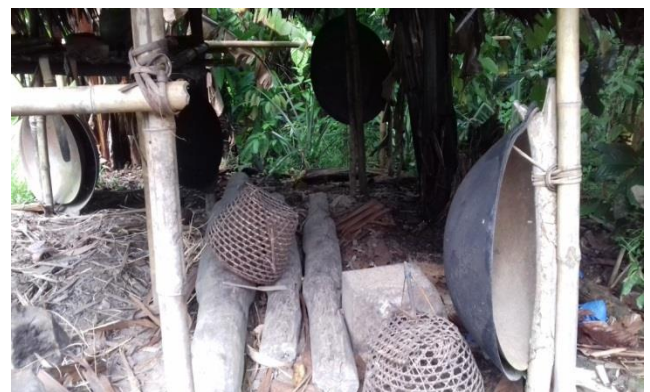
Figure 4. The household chores to process sago in Mentawai

Regarding this condition, Indonesian government tried to reinforce food program "Raskin", which is short for 'beras miskin' or 'rice for the poor'. In Mentawai, as elsewhere, that program does not supply the indigenous sago staple food, but rice for poor families. The social signal this program sends is that 'everyone should have rice to eat', reinforcing the message that sago and taro are second grade foods. Sago grows in wet and waterlogged soil. When people cut down a sago tree there are always some saplings in the vicinity which will take its place. After about eight years, the new trees are ready to be harvested. Normally, one good mature sago tree can produce sufficient starch for a family of four or five for about eight to ten weeks.