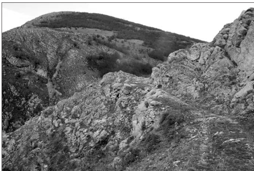
Fig. 2 Remains of the road viewed from the Svrlijig Fort

From the abundant archaeological material, especially coins, the site of Niševac can be dated to the sixth century BC all through to the nineteenth century AD. The oldest Roman coins date from the reign of Mark Anthony and Augustus. 18 The most plentiful and best preserved archaeological material comes from the Roman period. Noteworthy is also an ara dedicated to Jupiter, which has been dated to the third century AD. 19 Seen in a broader geographical context, the site of Niševac should be considered as forming a whole with the Svrlijig Fort and the site of Banjica. 20