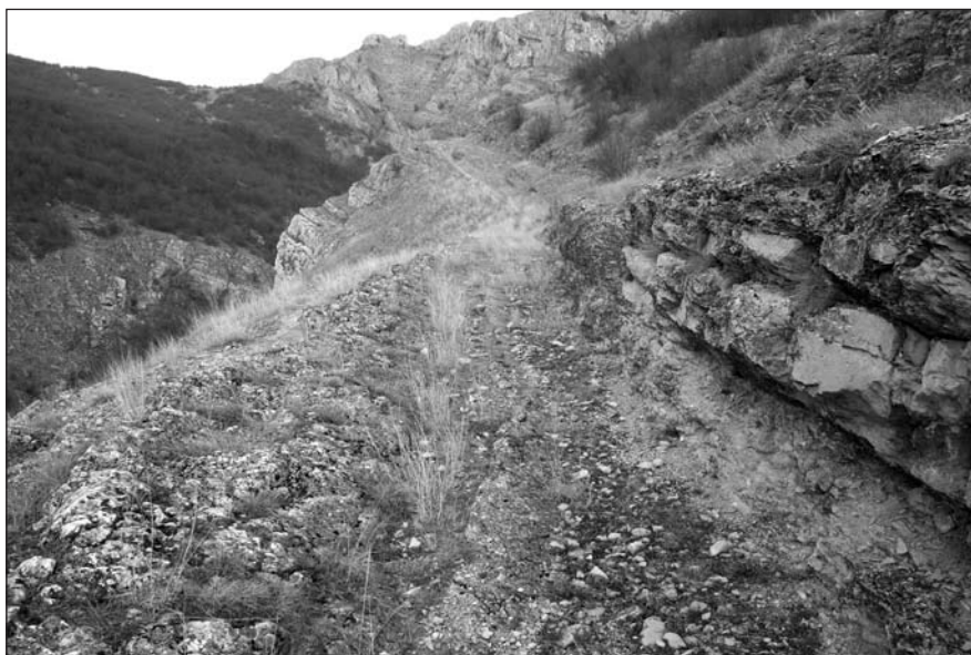
Fig. 1 Remains of the road with visible embankments at the entrance to the Svrlijski Timok gorge

tioned at Ravna (cohors II Aurelia Dardanorum). 9 In the far northeast of the region was the land of the Moesi , where the town of Ratiaria (Ratiaria, colonia Mesorum) developed, modern Arčar on the Danube. The confluence of the Timok and Danube rivers was inhabited by the Little Scordisci , a branch of the powerful Celtic tribe who had settled in present-day Srem (region between the Danube and the Sava) in the fourth century BC. 10