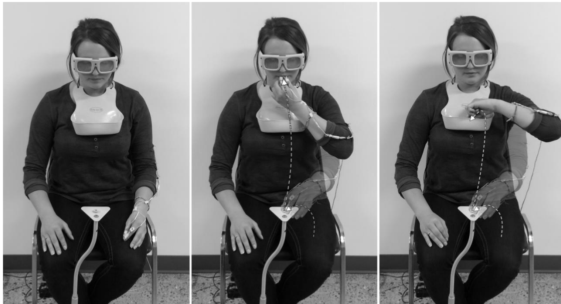
Figure 1– Experimental design. Left: Participants begin all reach-to-grasp actions in a “start position” with their hand resting on their lap, thumb and index finger together (item shown: Froot Loop®). Center: EAT task requires participant to eat the target after grasping. Right: PLACE task requires participant to grasp the target and place it in a bib hanging below his/her chin. Participants wore the bib throughout all blocks. PLATO™ liquid crystal glasses restricted participant vision between trials. Vision was unrestricted during grasps. All grasps were completed using only the index finger and thumb.

participant was naïve to the size of the food item until the beginning of the trial, when the goggles transitioned to their transparent state. After 1000ms of transparency during which the participant had full view of their hand and target, an audible go-signal ('beep') was presented, informing the participant that they should begin the reach-to-grasp movement "at a comfortable pace." After grasping the target between the thumb and index finger in a precision grip, participants would either a) ingest the item completely (EAT condition), or b) place the item in a bib hanging below their chin (PLACE condition) (Fig. 1). Investigators replaced food items between trials, while the liquid crystal goggles were in a closed (opaque) state. EAT and PLACE task conditions were presented in blocks of 25 trials (8 SMALL, 8 MEDIUM, 9 LARGE, randomized), with start order counterbalanced between participants. Participants were informed of task requirements at the beginning of each block. After both blocks were completed, IREDs were transferred to the participant's other hand, and the process was repeated. Hand start order was counterbalanced between participants.