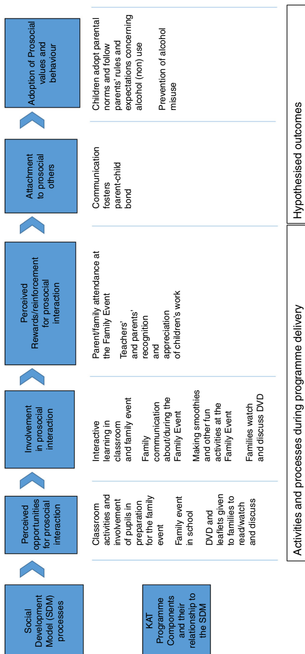
Figure 1. Logic model for the Kids, Adults Together Programme