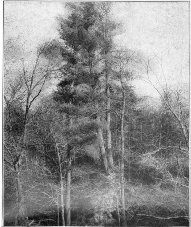
FIG. 2. Native Pinus strobus , Dubuque county, Iowa.