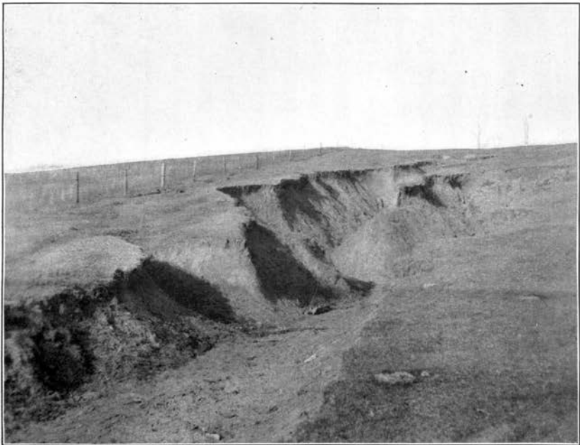
FIG. 2. A loess hillside stripped of its forest and now deeply eroded. Near Iowa City.