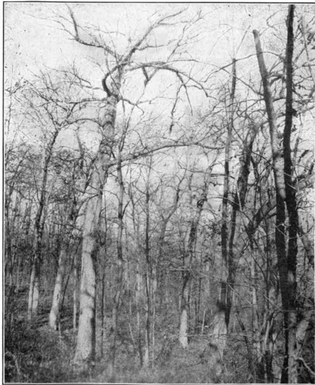
1904 Red Hills, Dubuque county, Iowa. Neither pastured nor burned.