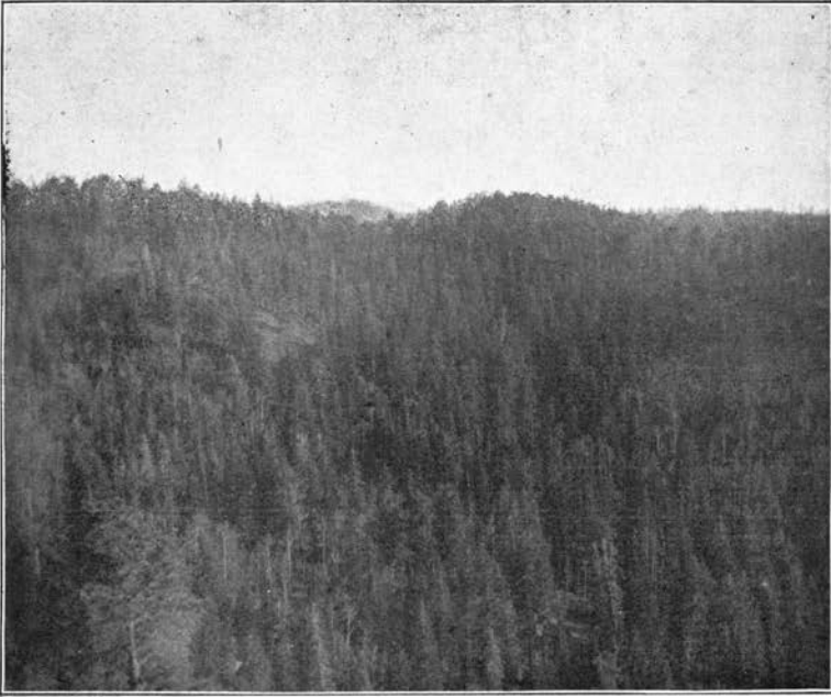
FIG. 1. Original pine woods. Sacramento mountains, New Mexico.