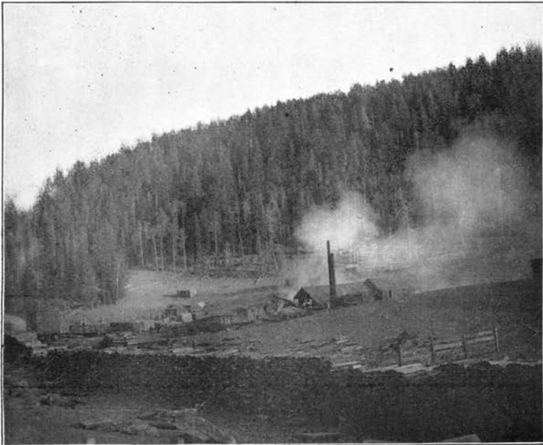
FIG. 2. Pine woods and saw mill. Sacramento mountains, New Mexico. The beginning of the end.