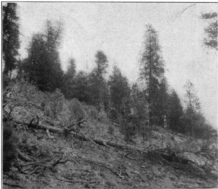
FIG. 2. Young Pinus ponderosa springing up on slope protected from fires and sheep. Sacramento mountains, New Mexico.