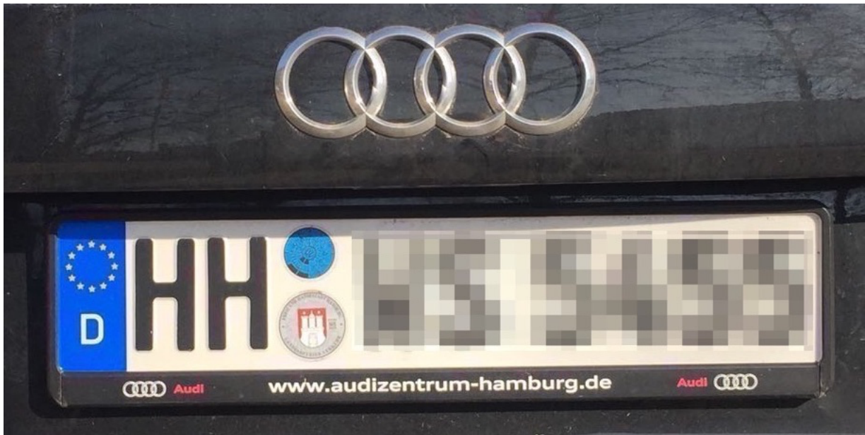
Figure 3. Hansestadt Hamburg License Plate

Hamburg residents. While these boosterist representations of networked mobility adorn walls and cars, indicating a smooth and frictionless geographical plain, one of the additional points we want to draw out here is the way that they also, at the same time, promote and reinvent urban history, tying a desired future to a selective memory of progress, openness and welcome.