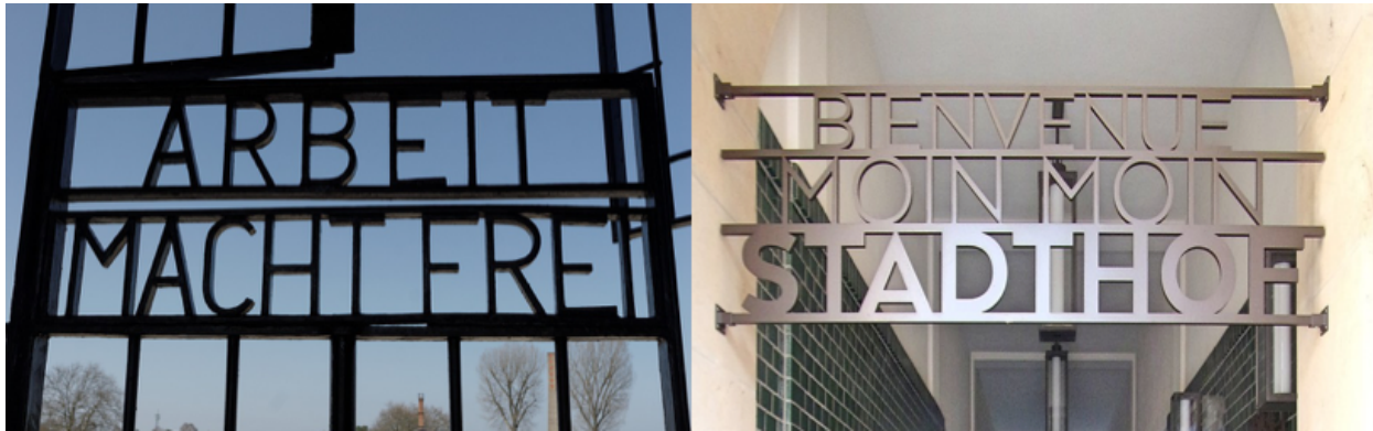
Figure 1. Left: Entrance gate at Sachsenhausen concentration camp; Right: Entrance gate at Hamburg's Stadthöfe

potential to disrupt the 'taken for granted' and 'business as usual'. When exposed or exhumed, spaces of danger pose an immediate threat to the existing order of space and time. Their emergence can cause remembrance and retellings—often leading to disruptive political practices and frictions impeding the smooth flows of capital.