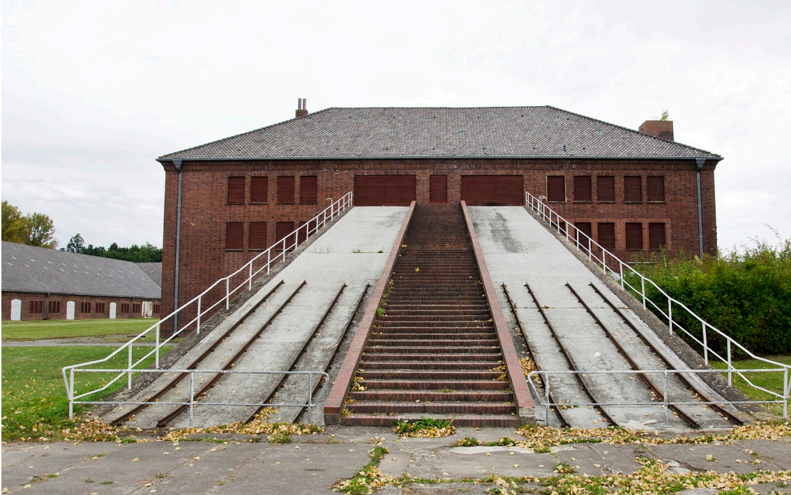
Figure 4. Brick factory at Neuengamme concentration camp

This removal continued after the war, when the city of Hamburg opted to destroy the wooden prisoner's barracks. But something similar took its place soon afterwards. When the city acquired the former camp in 1948 it began using the site as a municipal prison, replacing the old barracks with a new one in 1950. Meanwhile, the concentration camp's brick structures were kept intact, a few of them becoming administrative buildings. The most disturbing continuity was that some of the SS barracks were used to house prison employees. More of the former concentration camp was repurposed in this direction in the 1960s, when the city built another prison facility at the same location. It wasn't until 1989 that the city of Hamburg decided to relocate the prisons elsewhere, but it took until 2003 and 2006 for the two facilities to completely shut their doors (KZ-Gedenkstätte, 2018c).