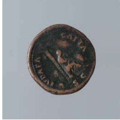
No. 44 – Rev.