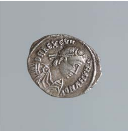
No. 5 – Obv.