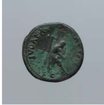
No. 38 – Rev.