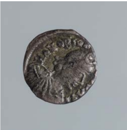
No. 3 – Obv.