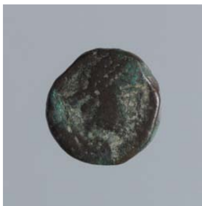
No. 23 – Obv.