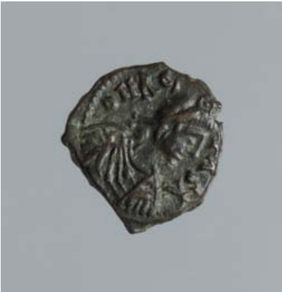
No. 13 – Obv.