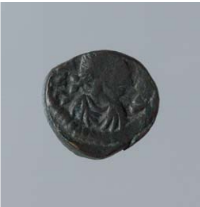
No. 21 – Obv.