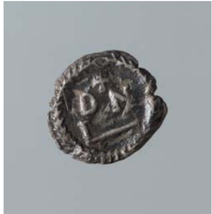
No. 19 – Rev.