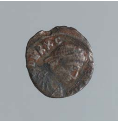
No. 6 – Obv.