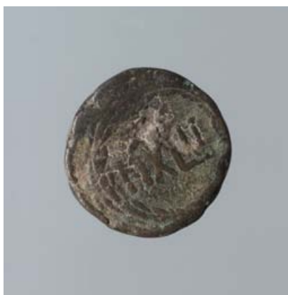
No. 29 – Rev.