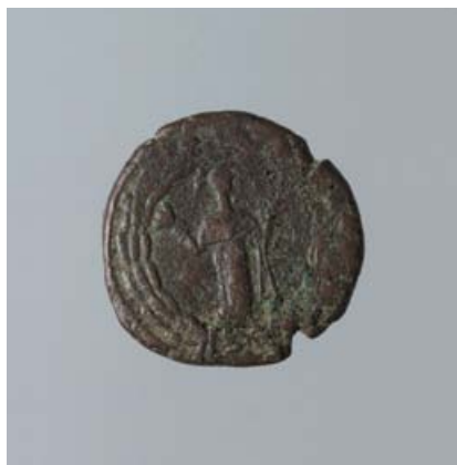
No. 28 – Obv.