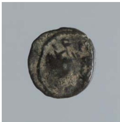
No. 16 – Obv.