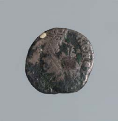
No. 1 – Obv.