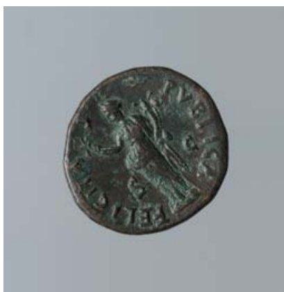
No. 42 – Rev.