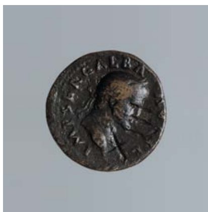
No. 43 – Obv.