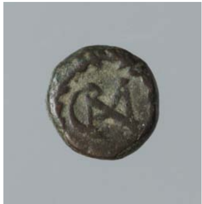
No. 20 – Rev.