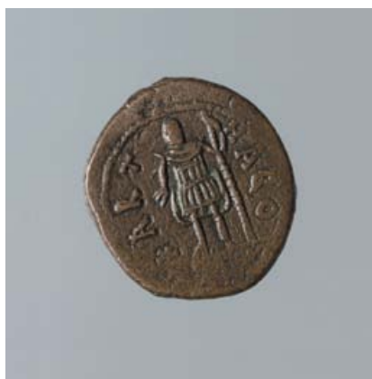
No. 24 – Obv.