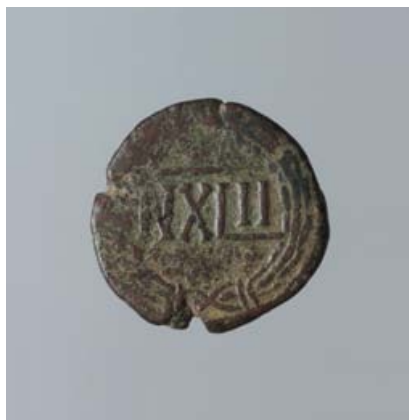
No. 28 – Rev.