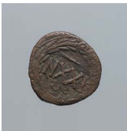
No. 30 – Rev.