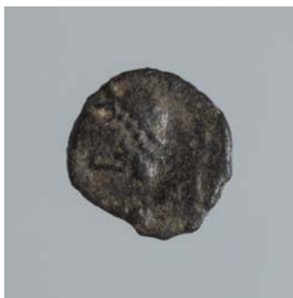
No. 17 – Obv.