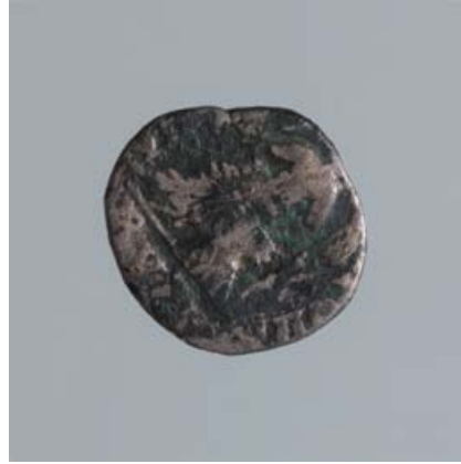
No. 1 – Rev.