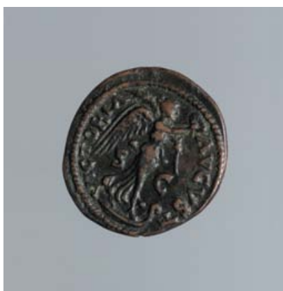
No. 37 – Rev.