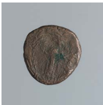
No. 30 – Obv.