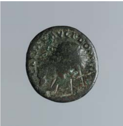
No. 40 – Obv.