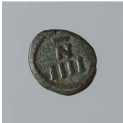
No. 34 – Rev.