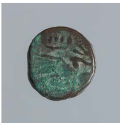
No. 23 – Rev.