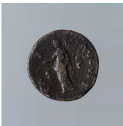
No. 43 – Rev.