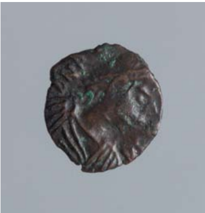
No. 14 – Obv.