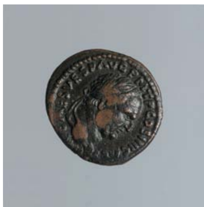
No. 36 – Obv.