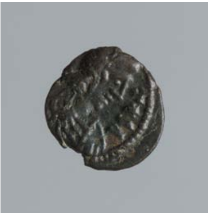
No. 12 – Obv.