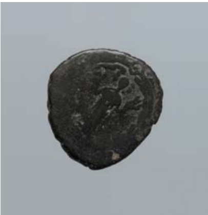
No. 27 – Obv.