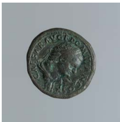
No. 42 – Obv.