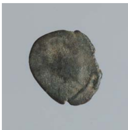
No. 18 – Obv.