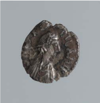
No. 19 – Obv.