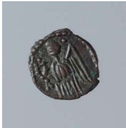
No. 14 – Rev.