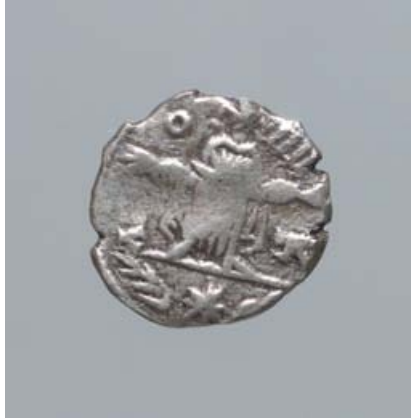
No. 4 – Rev.