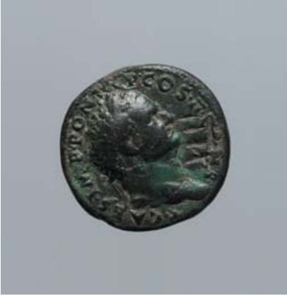
No. 38 – Obv.