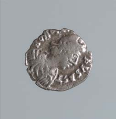
No. 4 – Obv.