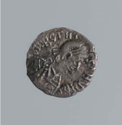
No. 10 – Obv.