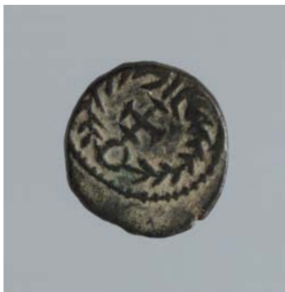
No. 16 – Rev.