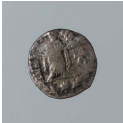
No. 3 – Rev.