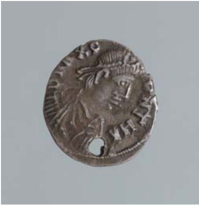
No. 7 – Obv.