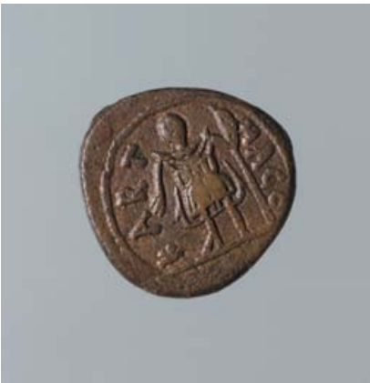
No. 26 – Obv.