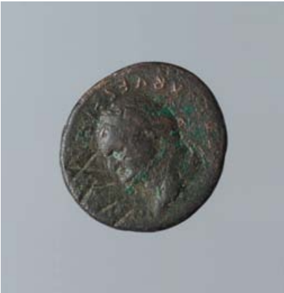
No. 39 – Obv.