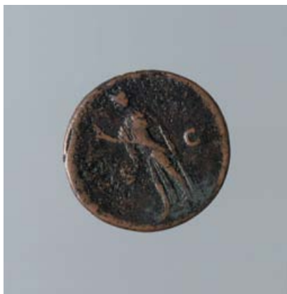
No. 41 – Rev.