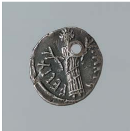
No. 15 – Rev.