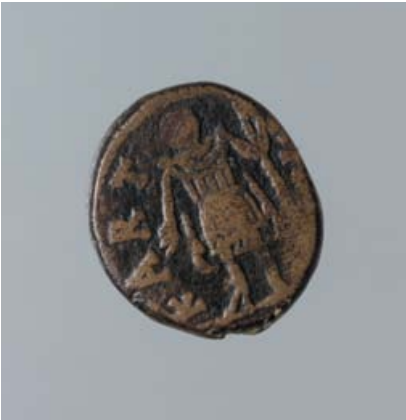
No. 25 – Obv.