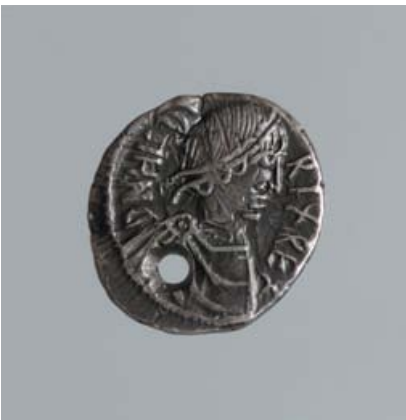
No. 15 – Obv.