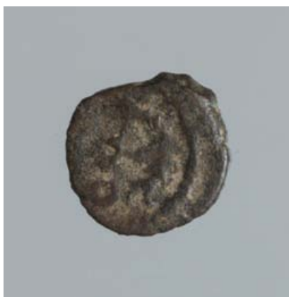
No. 17 – Rev.