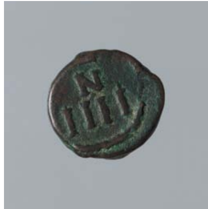
No. 33 – Rev.