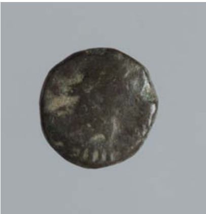
No. 20 – Obv.