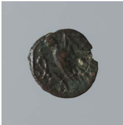
No. 12 – Rev.