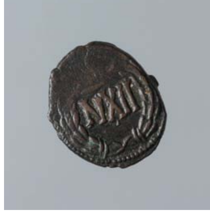
No. 32 – Rev.