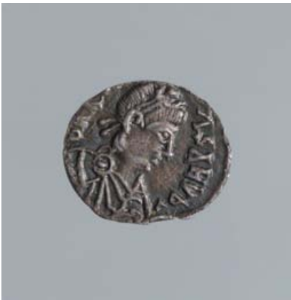
No. 9 – Obv.