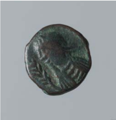
No. 33 – Obv.