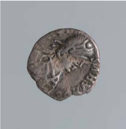
No. 11 – Obv.