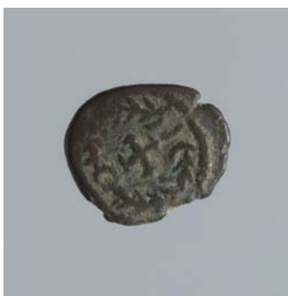
No. 18 – Rev.