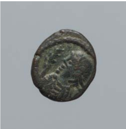
No. 34 – Obv.