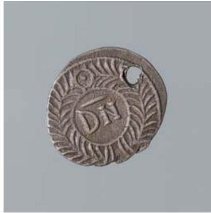
No. 7 – Rev.