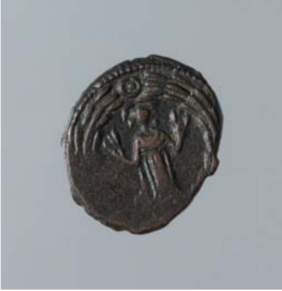
No. 32 – Obv.