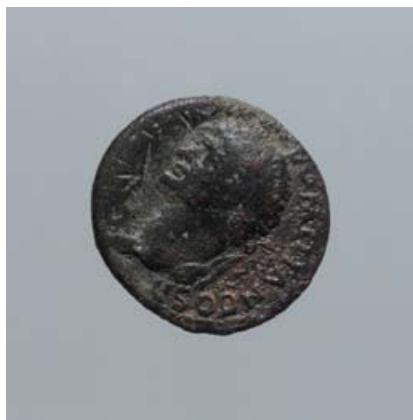
No. 35 – Obv.