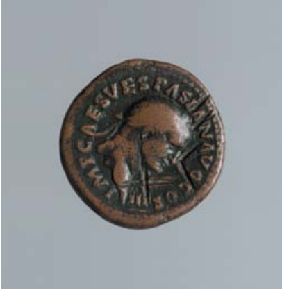
No. 44 – Obv.