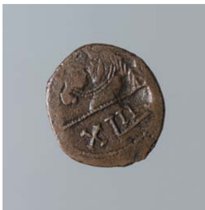
No. 24 – Rev.