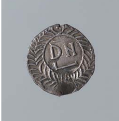
No. 10 – Rev.