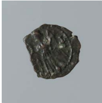
No. 13 – Rev.