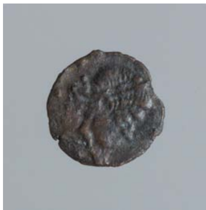
No. 22 – Obv.