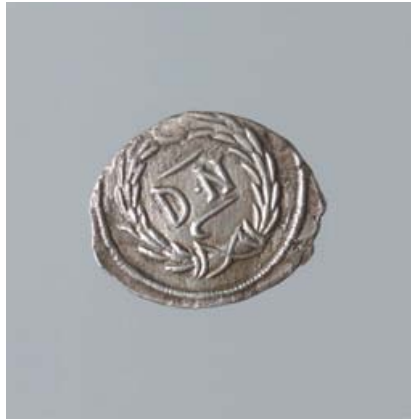
No. 5 – Rev.