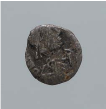
No. 8 – Obv.