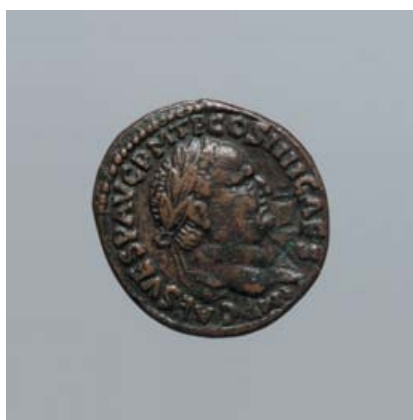
No. 37 – Obv.