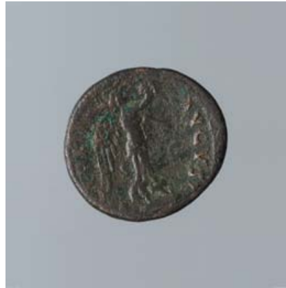
No. 39 – Rev.