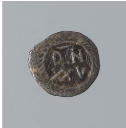
No. 8 – Rev.