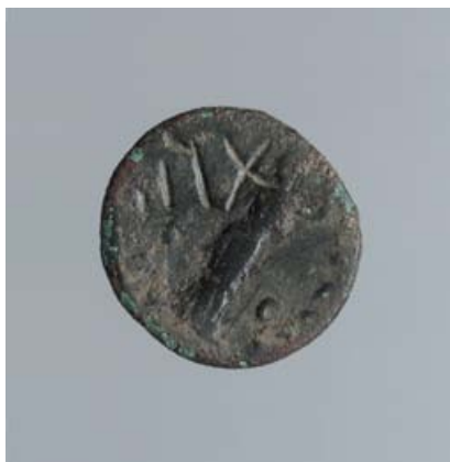
No. 35 – Rev.