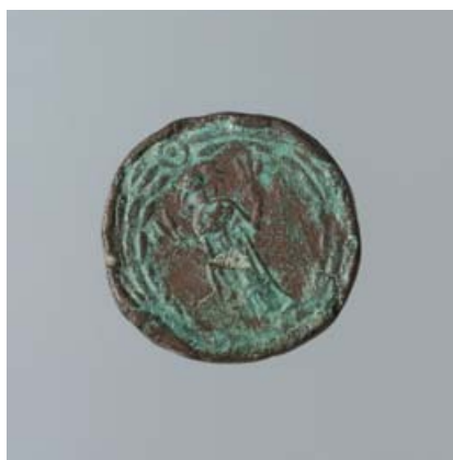
No. 29 – Obv.