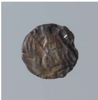
No. 22 – Rev.