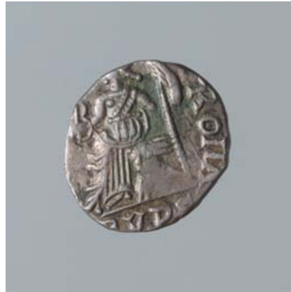
No. 2 – Rev.