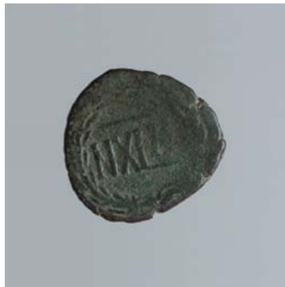
No. 27 – Rev.