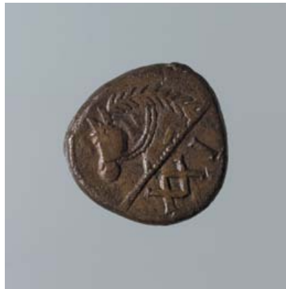
No. 26 – Rev.