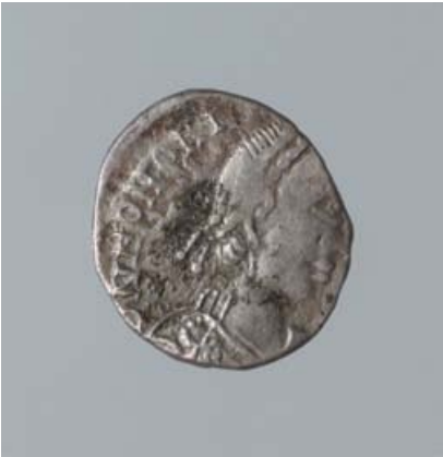
No. 2 – Obv.