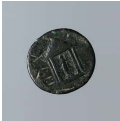
No. 40 – Rev.