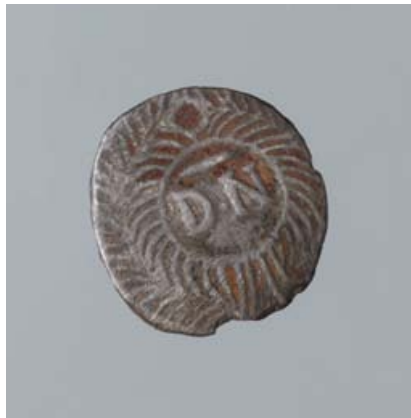
No. 6 – Rev.