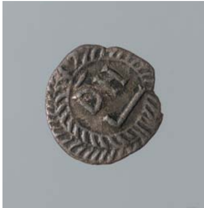
No. 11 – Rev.