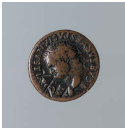
No. 41 – Obv.