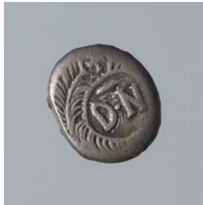
No. 9 – Rev.