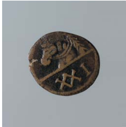
No. 25 – Rev.