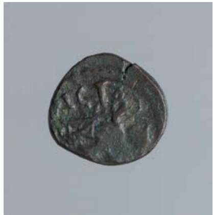
No. 21 – Rev.