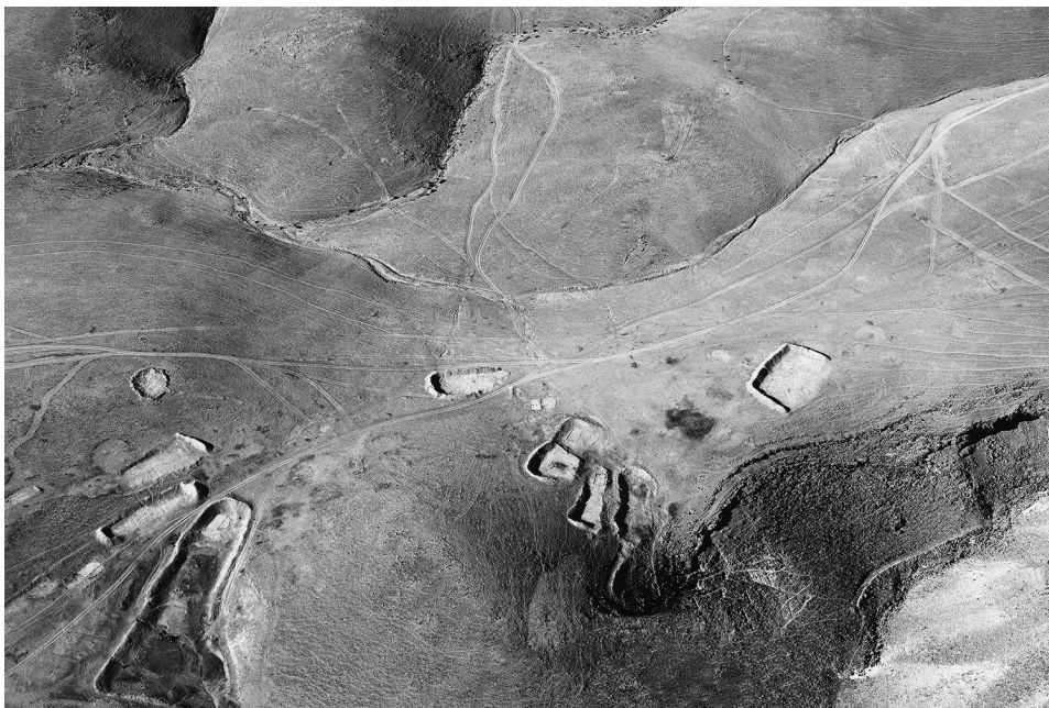
Sheikh. Desert Bloom 40. 2011.

that singularity. As such, the abstraction of these works is not the kind of abstraction that can be easily opposed to the figural or to the concrete. These images are abstract and figural, and they indicate world-historical forces and uniquely local histories.