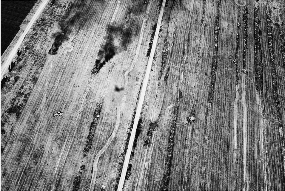
Sheikh. Desert Bloom 22. 2011.

Jewish National Fund's afforestation projects. "Desert Bloom" captures a social and natural world in transition and discloses traces of Bedouin habitations best apprehended by aerial photography. In Desert Bloom 34 the circular stains show the earlier presence of livestock pens, and the varying degrees of shade across the stains indicate how many rainy seasons have washed down on these traces.