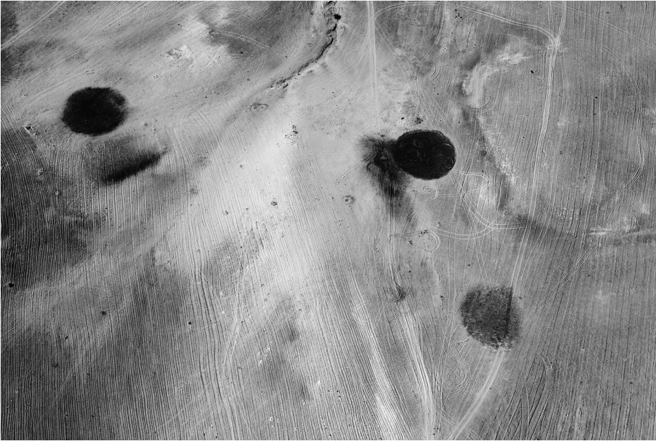
Sheikh. Desert Bloom 34. 2011.

ty, no roads, no water, no schools, and no one to provide us with medical aid and food that we need. . . . Our Nakba was not to be expelled outside the country, our catastrophe was to be concentrated.” 14