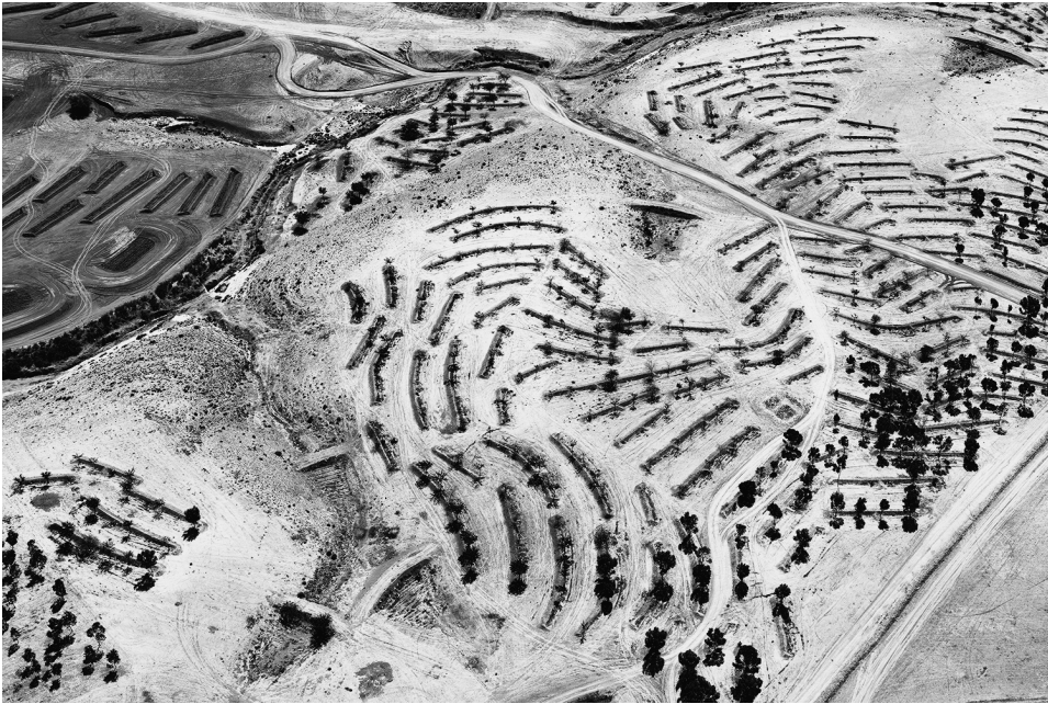
Sheikh. Desert Bloom 44. 2011.

Zionist Youth settlement movement founded in 1936). These are views of the Negev desert during a period of rapid transformation: At the time these photographs were taken, agents of the Israeli state were continuing to evict Bedouins from their settlements, forests were being planted, and the line of afforestation was being expanded as a result of natural and human-made processes. All of this, including the politics of establishing the “aridity line” (the limit beyond which no cultivation is possible), a line that changes with climate change but whose location can be adduced as evidence of “empty land,” is painstakingly detailed by Israeli architect Eyal Weizman and Sheikh in The Conflict Shoreline , a valuable recent history of the Negev desert and the forms of expropriation—economic, nationalist, political—overlaid onto this landscape. 13