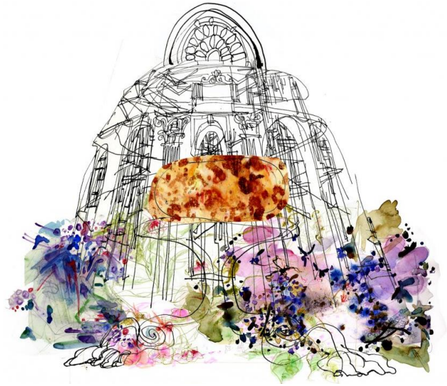
Figure 1. Illustration commissioned by JES copyright @ 2011 Margaret Hurst