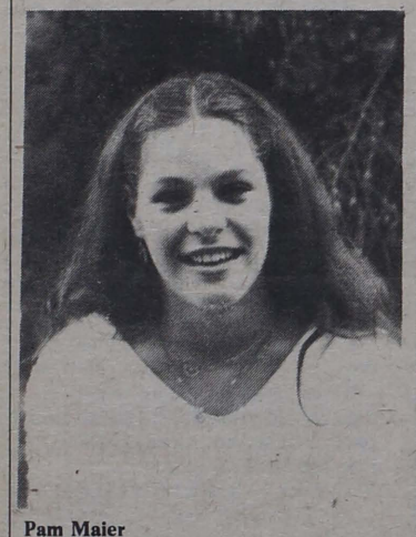
International Relations Freshman "The parties."