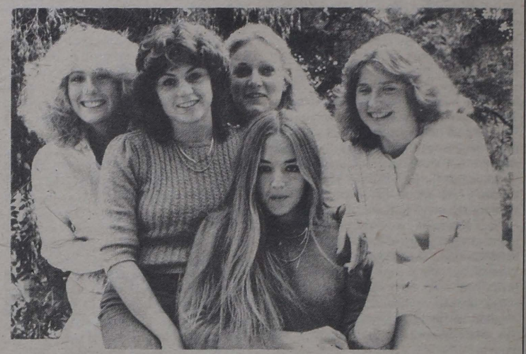
Paisley 2 says, "Paisley TWO!"