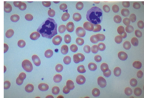
FIGURE 1: Hypersegmented neutrophils and hypochromic erythrocytes characteristic of a megaloblastic anemia. H&E stain. Magnification: 400x.

microangiopathies (TMA), autoimmune hemolytic anemia, drug-induced hemolysis (cephalosporins, dapsone, and levodopa), paroxysmal nocturnal hemoglobinuria (PNH), and other hereditary syndromes [13]. Vitamin B12 deficiency is not often associated with hemolytic anemia; however, upon literature review, there have been multiple cases with similar presentations [14] (Table 2). Vitamin B12 deficiency can cause hemolytic anemia most commonly via intramedullary hemolysis of immature reticulocytes; however, thrombotic microangiopathy is rarely seen [15]. Reticulocytopenia in cobalamin deficiency commonly reflects ineffective erythropoiesis in the setting of bone marrow involvement and intramedullary destruction as opposed to peripheral hemolysis as seen with TTP [15, 16]. This mechanism is initiated by premature death via hemolysis of the developing erythrocyte precursors in the bone marrow and is associated with the laboratory findings of hemolysis including elevated LDH, bilirubin, and decreased haptoglobin [16, 17]. However, very few cases of vitamin B12 deficiency have been linked with MAHA, and previous studies indicate that this may arise from acute hyperhomocystinemia which can lead to microangiopathic hemolytic anemia termed pseudothrombotic angiopathy [18]. Therefore, initial laboratory and pathologic findings can often mimic TTP in severe cases of cobalamin deficiency and in rare cases, such as ours, it can present with microangiopathic hemolysis.