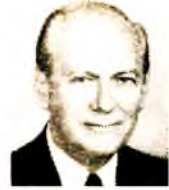
General Superintendent Benner

THE CHURCH OF THE NAZARENE is not an ecclesiastical accident. Our denomination was established by men and women who were fully committed to God, sensitive to the guidance of the Holy Spirit, and willing to pay any price to maintain their spiritual integrity and to promote scriptural holiness and aggressive evangelism.