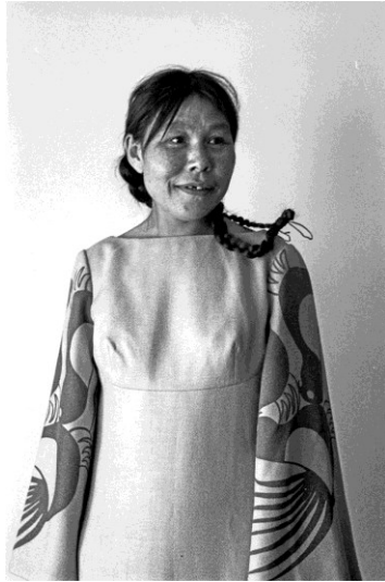
Figure 16 Kenojuak Ashevak in a garment showing textile printing, 1968.