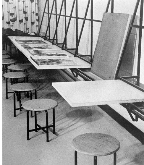
Figure 14 Design Canada: Canadian Design at Expo 67 National Design Council, 1968

The fabrics were also used in at least one of the 26 Habitat '67 model suites that were open as exhibits for Expo visitors to tour. The suite was furnished by Barbara MacLennan, a decorator service consultant with Chatelaine magazine. 43 The furniture used to decorate the suites was chosen from submissions to the Department of Exhibits and loaned for the duration of the fair; the 262 artworks used to decorate the spaces, including Inuit carvings and prints, were also loaned; and carpet and drapery fabrics were donated. 44 In an article on "Arctic Highlights at Expo" published in a 1967 issue of North , a publication of the Northern Affairs Branch, writer Helen Burgess notes the impact of the fabric, saying "The Cape Dorset flair for colour and design dominates one Habitat bedroom where glowing red and yellow drapery fabric ( Spirits and Birds by Pudlo) has been used in the drapes and bedspread." 45 The fabrics were supplied by CAP.