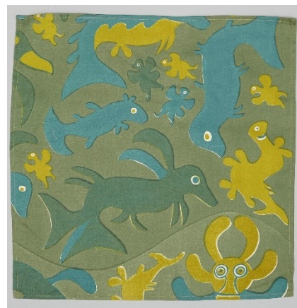
Figure 11 Unknown artist, sample. (L 44 x W 46 cm) cotton sateen twill, silk screen printed