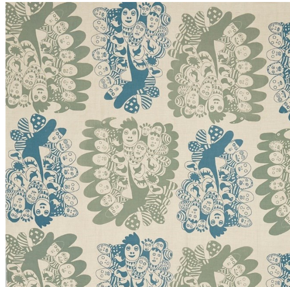
Figure 2 Pudlo Pudlat (1916–1992), Spirits and Birds (detail). Linen, silk screen printed (L 412 x W 118cm)

The textiles demonstrate a diverse range of influences: Inuit graphic tradition; preferences and priorities of the southern art market; contemporaneous graphic design; and the influence of traditional Japanese wood block and stencil printing techniques and visual style. Some of the artists involved in the textile printing program include Pitseolak Ashoona (c.1904–1983), Parr (1893–1969), and Pudlo Pudlat (1916–1992), now recognized for their print and drawing work. Important, yet unstudied, this moment in the history of the development of the WBEC represents a largely unknown and unattributed body of work for many of the early WBEC artists.