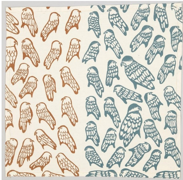
Figure 1 Ulayu Pingwartok (1904–1978), Little Hawks . Unbleached cotton, silk screen printed (L 412 x W 118cm)

The Textile Museum of Canada holds a collection of close to 200 printed fabrics designed by Inuit artists at Kinngait Studios in Kinngait (Cape Dorset) during the 1950s and 1960s. The pieces are owned by the West Baffin Eskimo Co-operative (WBEC) and are on long-term loan to the Museum. 1 The collection is a physical record of a relatively short-lived fabric printing initiative that was undertaken during the experimental years when Kinngait's famous print program was just beginning. Study of this production is an essential and under-researched facet of the history of Inuit art and one which is inextricable from the history and evolution of the broader print and visual culture of Kinngait, and which has important relevance today.