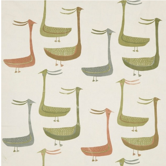
Figure 13 Anirnik Oshuitoq (1902–1983), Fabulous Geese , L 274 x W 111 cm (detail) unbleached cotton, silk screen printed

Jeff Goode shows Ishuhungito Pootoogook's Birds in Flight used as curtains in a music classroom in the Canadian pavilion.