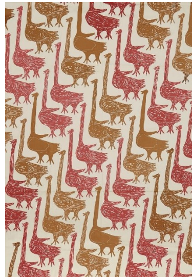
Figure 7 Parr (1893–1969), Proud Geese (detail) , cotton sateen twill, silk screen printed (L 508 x W 113cm) Reproduced with the permission of Dorset Fine Arts.