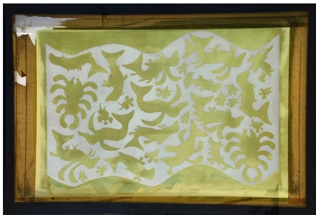
Figure 10 Silk screen from Kinngait Studios.