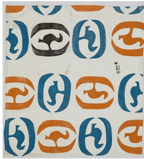
Figure 9 Sheouak Petaulassie (1918–1961), sample (L 44 x W 44 cm) cotton polyester broadcloth, stencil printed

There are examples in the collection of the experimental use of stencils and brush to apply designs (see Figures 8 and 9). In some of these printed with stencils, the repeats are not uniformly placed, and there are uneven applications of the colour. These examples are a valuable