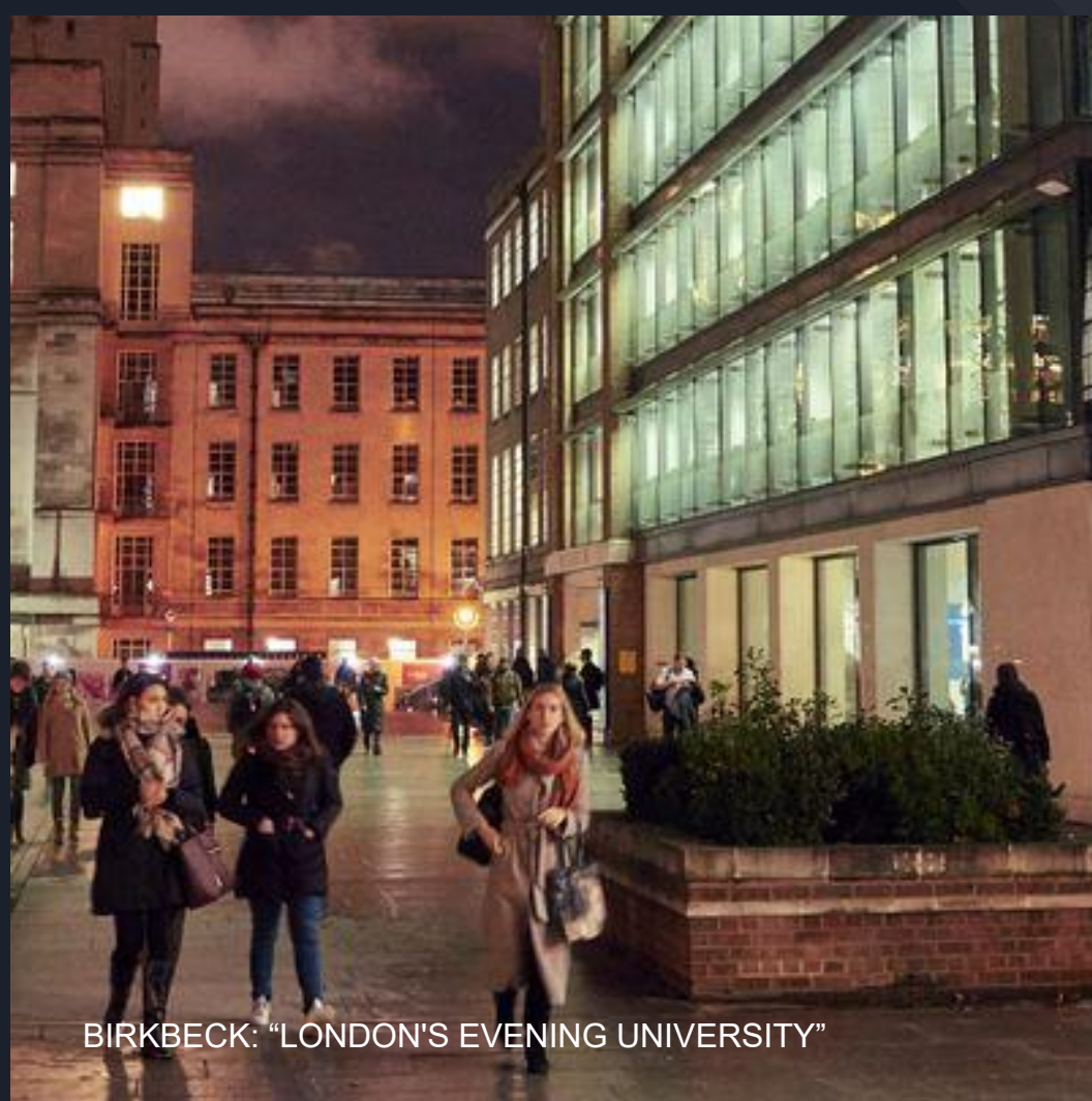
BIRKBECK: "LONDON'S EVENING UNIVERSITY"