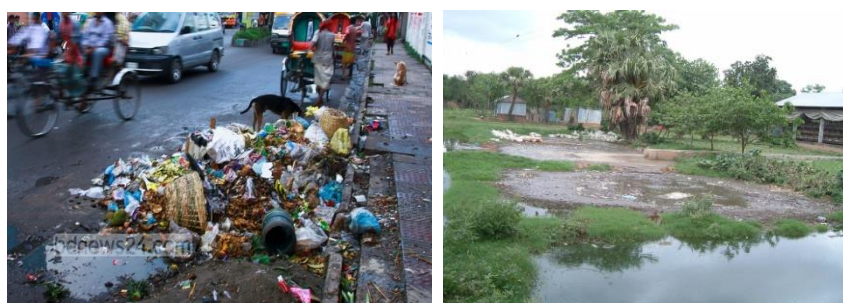
Figure 4. Roadside waste dumping in Dhaka (left) and dumping of poultry litter adjacent to water courses (right) [31].

Current and previous research work [28] shows that dung from cattle small holdings is mainly suitable for domestic sized AD plants, while wastes from poultry farms are more suitable for medium sized plants. Wastes from cattle markets can be used in large or extra-large AD plants. We can categorise the AD plant sizes according to their daily biogas yield capacity as: Small domestic (<2 m 3 ), domestic (2–5 m 3 ), medium (5–25 m 3 ), large (25–150 m 3 ) and very large (>150 m 3 ).