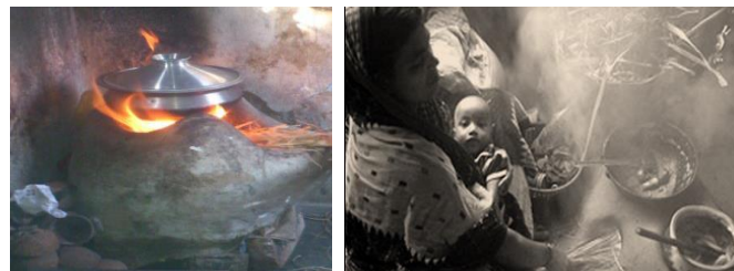
Figure 1. Typical example of a traditional biomass cooking stove [15] (reproduced with permission from Sowgath, 2015).

Rural people in Bangladesh constitute 76% of the population and regularly use a mud-built cylinder stove (placed on three raised plinths and situated above or below ground level) for cooking and heating purposes—refer to Figure 1 [13]. An opening between these plinths provides a convenient fuel-feeding port, whilst conversely, the remaining two openings provide flue gas exit ports. This mode of biomass cooking within domestic properties creates a significant volume of indoor air pollution and represents a major public health hazard for occupants [14]. This is because, traditional biomass fuels generate more pollution than comparatively cleaner alternatives, such as kerosene or biogas. The cumulative impact of burning biomass upon both the general public and environment dictates that new and/or alternative sources of energy production are urgently required in Bangladesh.