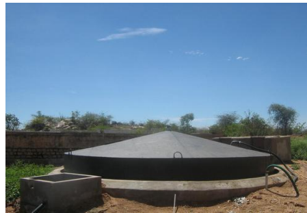
Figure 3. Typical example of a biogas supplied via flexible pipeline in India [48].

has been created through the sales of biogas to their neighbours. Typical biogas charges to rural families oscillate around 800–1000 taka (£8–£10) per month and this steady income stream ensures that pay-back of installation costs occur over a shorter period of time [28]. For example, this present research study found a singular poultry and similarly, another dairy farmer selling biogas to their neighbours via an innovative and affordable flexible pipeline. Other plant owners were observed to be selling biogas to up to six households from a singular 10 m 3 biogas plant; each household had to pay 500 taka (£5) per month for this instantaneously biogas service, thereby generating 3000 taka (£30) for the farmer. According to an estimation provided by Islam [44,45] the total cost to build a sand cement, brick made fixed dome biogas plant (Figure 3) having biogas capacity 10 m 3 (a day) is around 250,000 taka (£2400). Many biogas plants are purchased by poor rural households via loans offered by the government, banks/financial institutions or NGOs—even when generous subsidies are available [45–47].