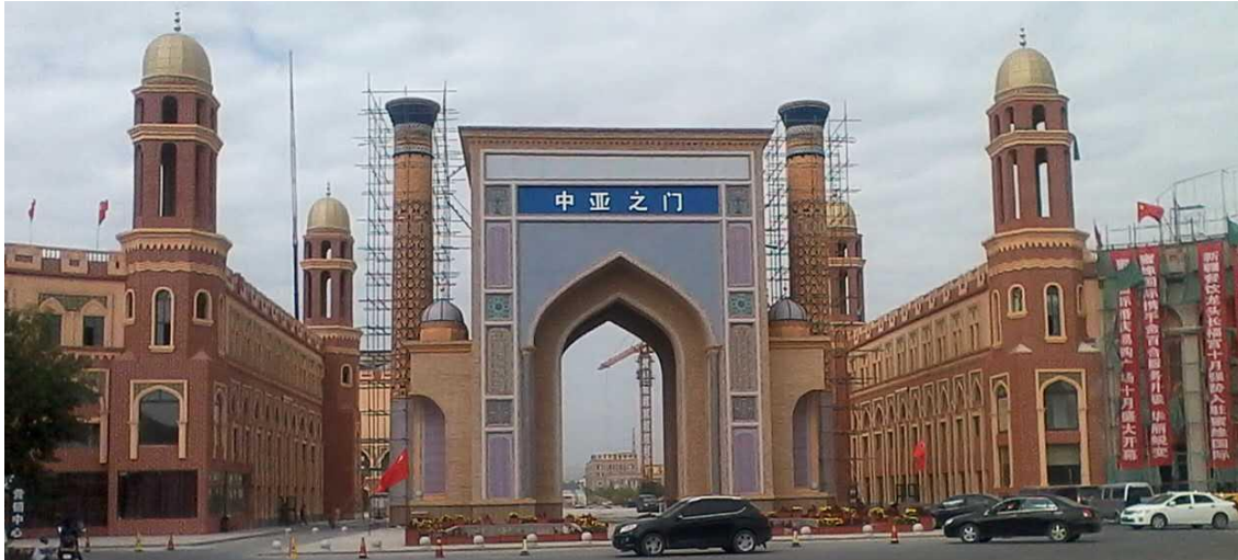
Figure 1: Trade center Zhongya Zhimen (the gate of Central Asia) is established in Yining City in 2015 after the proposal of the “economic zone of the Silk Road”. The center is a business complex including shopping, dining, entertainment, and hotel services.

Source: Mayinu Shanatibieke, January 28, 2016