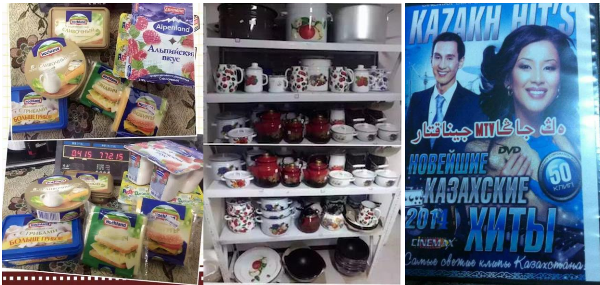
A: Dairy foods imported from Kazakhstan B: Kitchen utensils imported from Kazakhstan C: A copied music CD of Kazakhstan singers (Arabic and Cyrillic scripts are written on the CD cover)

Xinyuan County is situated along the ancient Silk Road within a region that historically served as an intercultural conduit for goods, information and ideas. Currently, heeding the call of developing the New Silk Road (Chin: xin silu ) from the central government, Xinyuan County actively joins Sino-Kazakhstan trade. On the one hand, the county government encourages local enterprises' export of industrial goods such as liquors and iron materials to Kazakhstan (Xinyuan County 2015). 12 On the other hand, the county government established several commodity markets selling imported food, handicrafts, clothes, kitchen utensils, and music CDs from Kazakhstan (see Figure 3). Consequently, the multi-directional flow of goods and people across the border is steadily increasing. The open trade has accelerated the cross-border migration of Kazakhs in recent years.