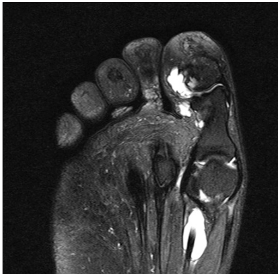
Fig. 1. A 62-year-old male with ganglion cyst around the hallux. On axial view magnetic resonance imaging, ganglion cysts around the hallux had communicating stalks with the interphalangeal joint, and there was a large fluid accumulation within the synovial sheath of the flexor hallucis longus. This patient also had a joint effusion in both the metatarsophalangeal and interphalangeal joints.

Follow-up: the period from the final surgery to the last follow-up, MTP: metatarsophalangeal, IP: interphalangeal.