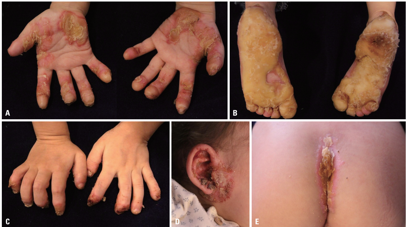
Fig. 1. Skin lesions at the initial clinical presentation. Diffuse severe keratoderma on (A) the palmar and (B) the plantar surfaces. (C) Onychodystrophy of all fingernails. (D) Periauricular hyperkeratotic papules with eczematous patches. (E) Hyperkeratotic yellowish plaques on the gluteal fold.

(Fig. 2C). Electron microscopy showed multiple, variable-sized electron-lucent lipid vacuoles in the hyperkeratotic horny layer (Fig. 2D and E), and numerous polysome-like structures in