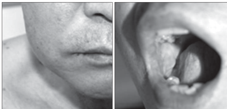
Fig. 1. Picture of edema in right cheek and buccal mucosal membrane.