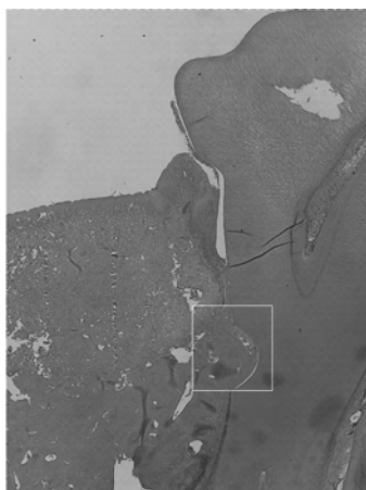
Figure 2. Control 8 weeks( \times 40 , H-E).