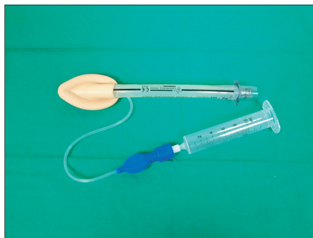
Fig. 1. Preparation of the resting volume as a simple method for partial inflation of the LMA cuff.

All children were not premedicated. Upon arrival at the operating room, patients were monitored with pulse oximetry, capnography, inhaled and exhaled sevoflurane concentrations, noninvasive arterial blood pressure and electrocardiography. Anesthesia was induced using an inhaled technique with 6 vol% of sevoflurane in oxygen. After loss of consciousness, a peripheral venous cannulation was performed and sevoflurane was adjusted to 3–3.5% and maintained for several minutes until adequate jaw relaxation was attained for LMA insertion. In previous studies to assess adequate anesthetic depth for LMA insertion in children without neuromuscular blocking agents, the end-tidal sevoflurane concentration was 2.2 to 3.6 % [10,11]. Then, we used a 3–3.5% sevoflurane concentration to abolish the pharyngeal reflex of the patients. The LMA was inserted by lateral or rotational techniques which were described to improve the success rate of LMA insertion in previous studies [1-3]. The successful insertion was confirmed by observing adequate chest wall movement and the presence of a square wave on the capnograph trace during gentle squeezing of the