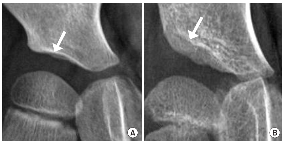
Fig. 1. Sourcil (arrow) in the normal hip (A) and dysplastic hip (B).

The outermost edge of the acetabular roof was regarded as the datum point from where the Perkin's line (P-line) was drawn. Likewise, another P-line was drawn from the lateral edge of the sourcil. The former and the