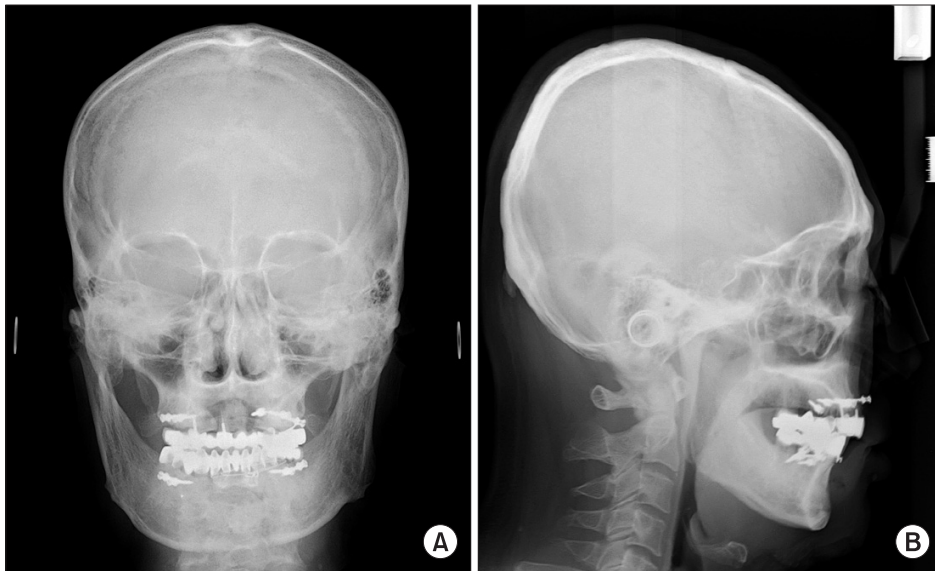
Fig. 3. Postoperative posterior-anterior (A) and lateral (B) cephalographic images demonstrating the satisfactory reduction of symphyseal fracture and bilateral reduction of both mandibular intact condyles. Slight lateral displacement of the right condyles is noticeable in the lateral view.

Bong Chul Kim et al: Reduction of superior-lateral intact mandibular condyle dislocation with bone traction hook. J Korean Assoc Oral Maxillofac Surg 2013