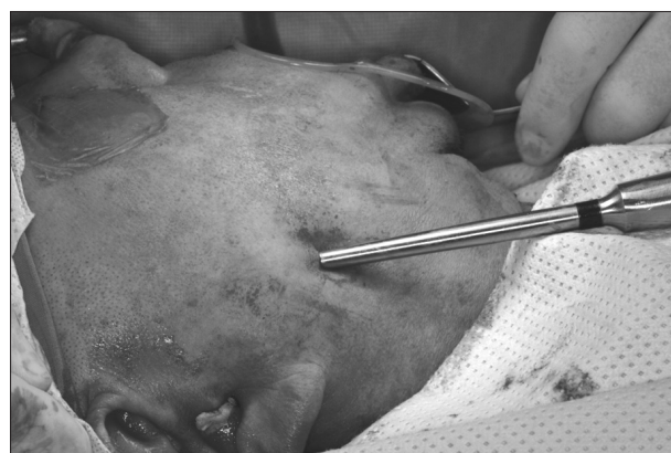
Fig. 2. Successful reduction of the right intact condyle was performed by applying external force with bone traction hook via stab incision at the level of sigmoid notch of the same side.

Allen and Young 2 classified the lateral dislocation of the