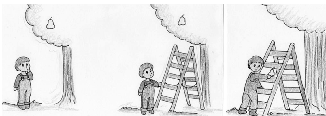
Figure 1. Picture sequence.

The procedure is as follows: Each picture sequence is introduced by a short narrative where a boy, called João/Peter, is involved in an act (e.g., picking a pear from a pear tree). A question about this narrative sequence follows which contains, or does not contain, the referent of the direct object. In their answer, the participants have to use the direct object (see Example 5). 2