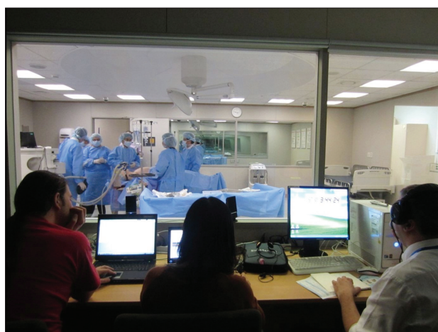
Fig. 1. Simulation in the operating room.

Scenarios should be designed according to the entire simulation program. The designing process for scenarios are: 1) the scenario must include an opportunity for trainees to use judgments relevant to the training goals; 2) the scenario must have high fidelity for the clinical environment; 3) the scenario must include essential diagnostic and treatment skills required to manage the simulated condition; 4) practice experts must agree on these essential diagnostic and treatment skills; 5) an approach to evaluate, score and offer objective feedback must be provided following the scenario; 6) the scenario needs a copious, easy and clear description; 7) the scenario must include required skills embedded into the curriculum; and 8) crisis events are included in the compressed timeline.