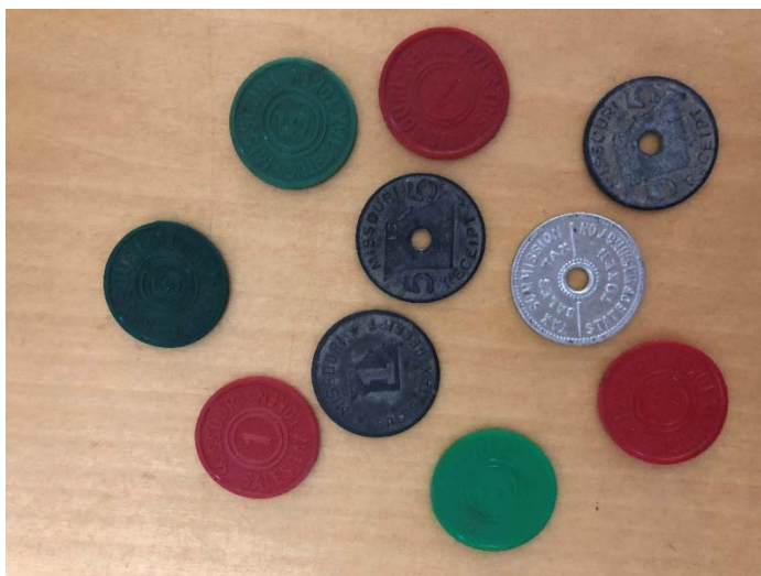
Photo by Annette Nellen of metal and plastic sales tax tokens from her private collection.

In the 1930s, many states levied sales tax on merchandise to raise revenue to help recover from the Great Depression. Many of the items that were sold at that time were available for a dime or less. Thus, a sales tax levied at 2 percent, required two-tenth of a cent to be collected, which was a difficult task for a merchant due to the absence of a fractional cent denomination or coin. Thus, a system of sales tax tokens was born to facilitate payment of sales tax. These tokens were made of metal, plastic, fiber and cardboard, and the value was usually in “mills” (one-tenth of a cent). The twelve states that issued tokens were Alabama, Arizona, Colorado, Illinois, Kansas, Louisiana, Mississippi, Missouri, New Mexico, Oklahoma, Utah, and Washington. Sales tax tokens were not popular and were considered a nuisance to the customer, and hence by the end of World War II, many states stopped using the tax tokens. 1