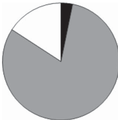
Fig. 3. Simulant effects on melamine migration. A: 10% ethanol; B: 3% acetic acid; D: 50% ethanol. ■: Simulant A; ■: Simulant B; □: Simulant D

Considering the cumulative effects of food simulants on migration; simulant B was found to be more significant ( P<0.01 ) than the others for each brand. The migration ratio for all simulants is schematized in Figure 3.