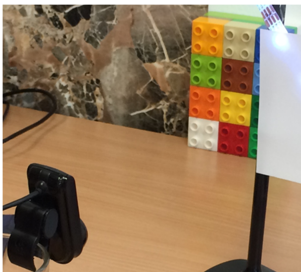
Fig. 3. One setup of the measurement with the Logitech c905 camera

calculated from the R,G,B differences as using them for the pixels R,G,B-channels as a coefficient. See these ratios below ( Table I ). Using this transformation, all the pixel colors in the high color temperature image were changed, resulting in a corrected image. That image should be close to the low color temperature image. 2x4 pictures have been investigated. Four were taken with low correlated color temperature settings, four with high CCT settings. The cropped RGB LED image parts (R1, R2, G1, G2, B1, B2) are shown below in Fig. 5 . The white LED had not been included; later it will be explained why.