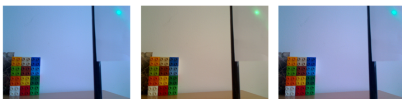
Fig. 6. Low CCT setting, high CCT setting and modified high CCT setting images

After the gamma correction the ratios in Table II were applied for every pixel in the high CCT setting image and a modified image shown in Fig. 6 was resulted.