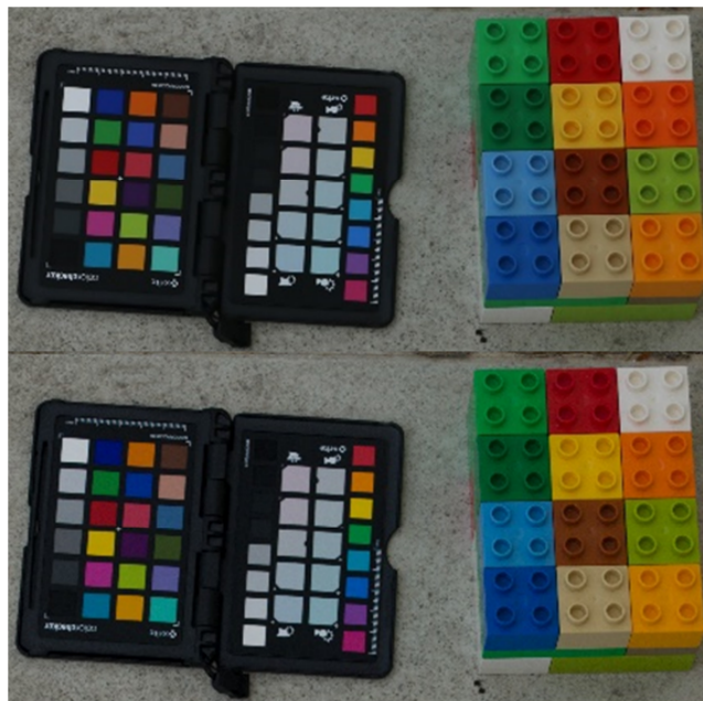
Fig. 2. Color correction based on the X-Rite ColorChecker