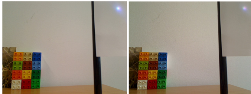
Fig. 7. Images under 3500K CCT (fl. lamp) and 6200K CCT conditions (dif. day)

In the second trial, the question was what the AWB function of the c905 camera is good for. Two images were taken with AWB settings under two different illuminations. One was a simple fluorescent lamp (fl. lamp), typical in offices with a CCT of 3500K, natural white. The second one was a diffuse, non-direct daylight (dif. day) which is close to a CCT of 6200K, shadow. Hence the AWB setting, the camera compensated for the different WB illumination conditions ( Fig. 7 ).