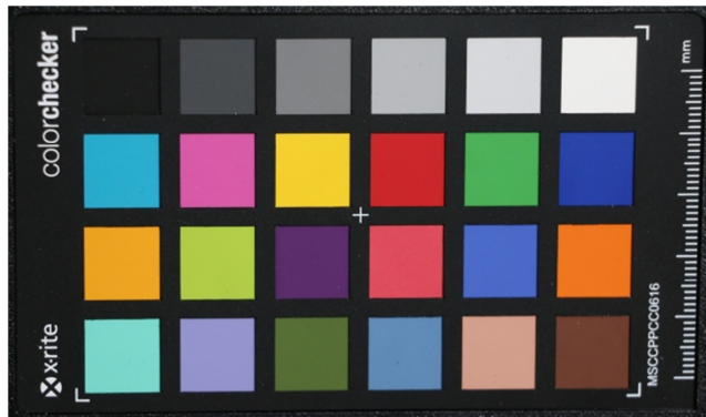
Fig. 1. Colors of the X-Rite ColorChecker

image. One result can be seen in Fig. 2 , where the upper shadowy image was corrected and more accurate colors achieved (look at the most right colors).