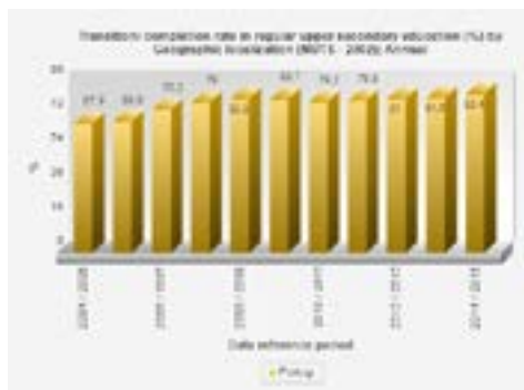
Figure 2. Year transition rates in the Portuguese secondary school; note the marked growth starting from the academic year 2005/2006, since the new curricula were introduced