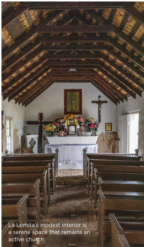
La Lomita's modest interior is a serene space that remains an active church.