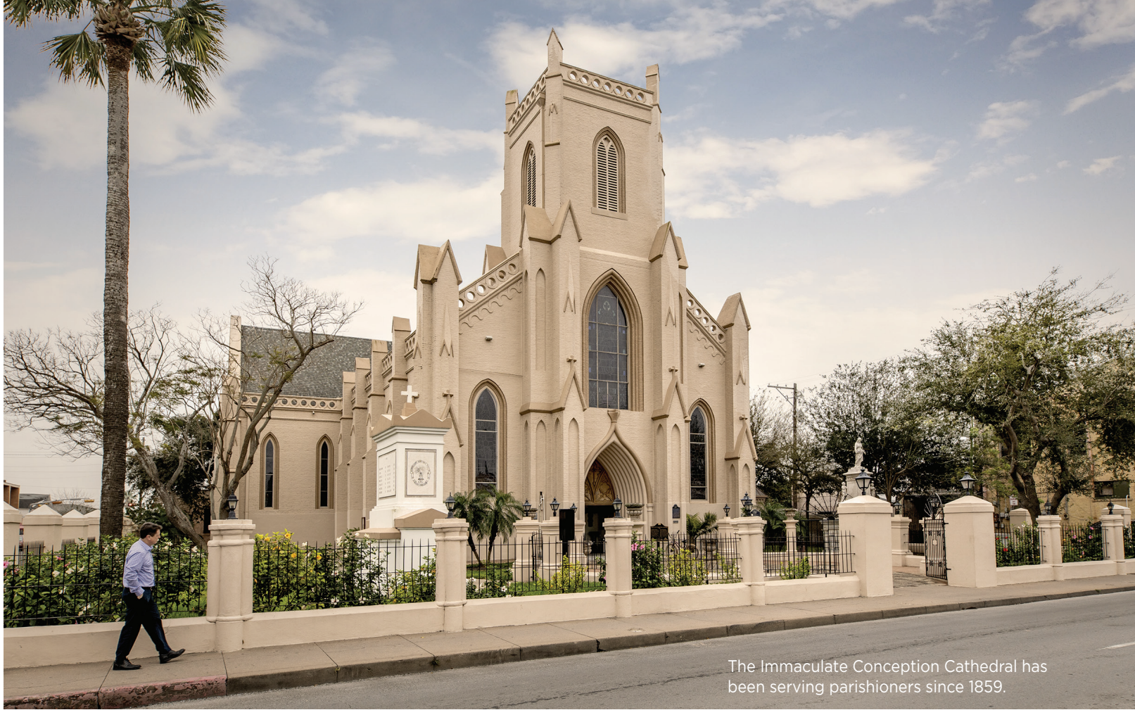
The Immaculate Conception Cathedral has been serving parishioners since 1859.