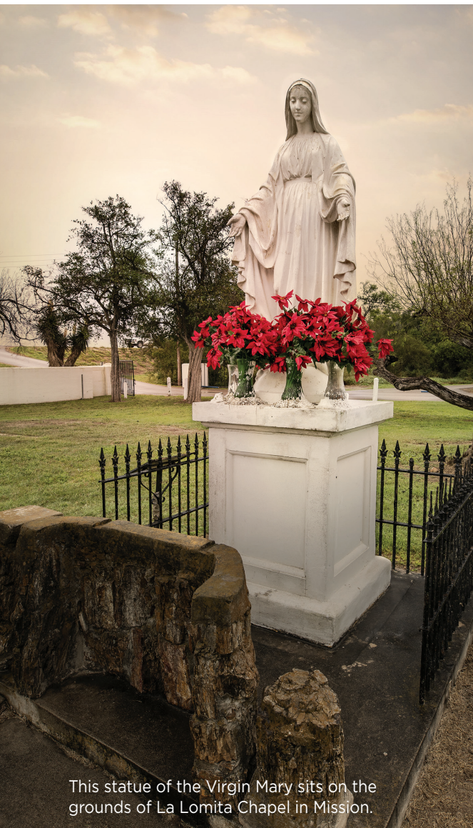
This statue of the Virgin Mary sits on the grounds of La Lomita Chapel in Mission.

From modest adobe chapels to grand Gothic Revival cathedrals, these sacred spaces offer a peaceful place to take time to contemplate the spiritual. The calming sounds of light breezes through windows and choral music provide a joyful escape from outside noise.