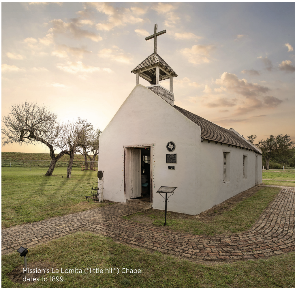
Mission's La Lomita ("little hill") Chapel dates to 1899.