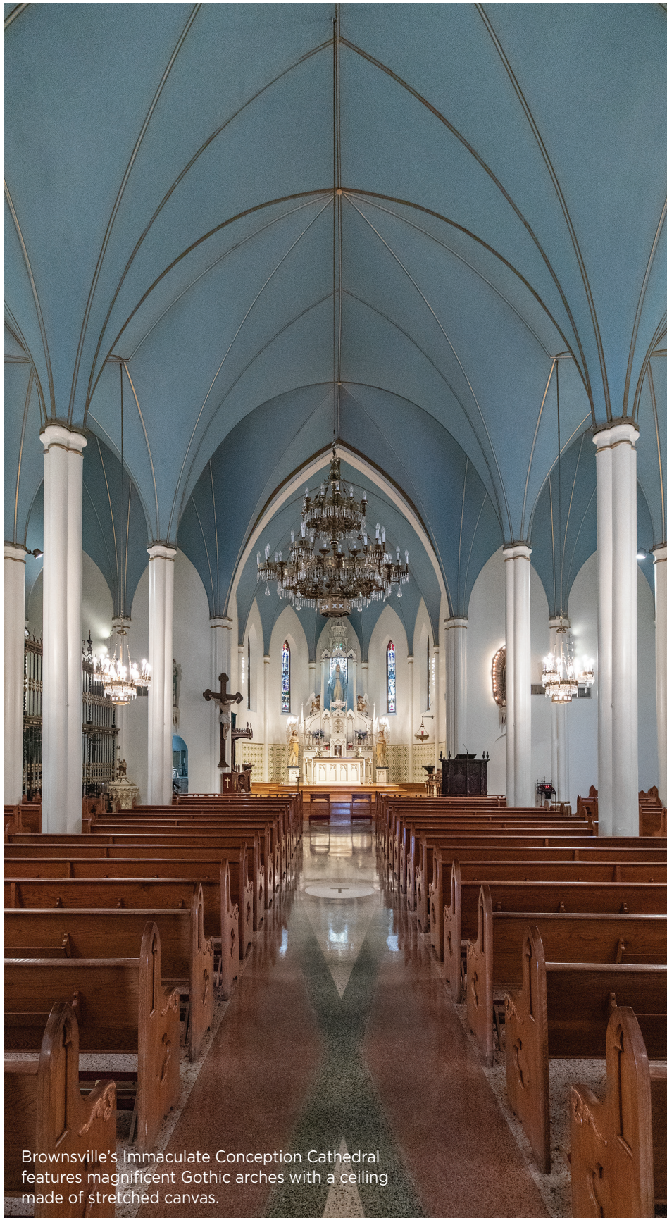
Brownsville's Immaculate Conception Cathedral features magnificent Gothic arches with a ceiling made of stretched canvas.