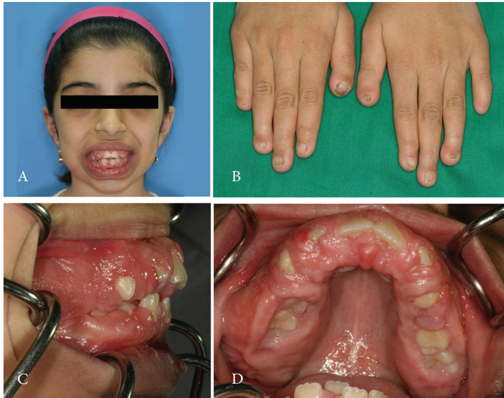
Fig. 1: Nine-year-old female patient with a Zimmermann-Laband syndrome phenotype. Note gingival hypertrophy and thick lips (A, C, and D). Nails of all fingers are hypoplastic. Absence of fingernails of the first fingers on the left and right hand is seen (B).

A 9-year old girl was referred to the oral surgery clinic because of "gum overgrowth". Prior to her referral, she had undergone surgical procedures, namely rectal polyp, renal sx due to hydrouretronephrosis and adenoid tonsillectomy, when she was one, four and six years old, respectively. Moreover, she had a history of small ventral septal defect (VSD) G > 52 mmhg, hepatosplenomegaly and growth. Her medical issues were congenital and recurred after three gingival surgeries performed over the past four years. Gingival hypertrophy (Fig. 1A, C, and D), telecanthus, hepatosplenomegaly, hypertrichosis and hypoplasia of terminal phalanges (Fig. 1B) with nail