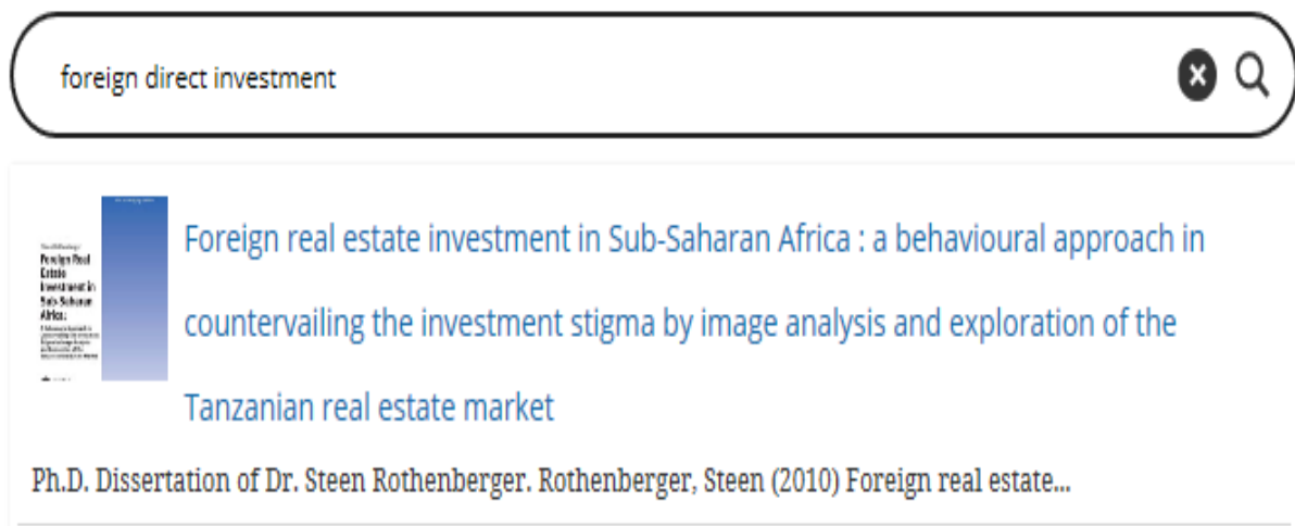
Figure 3b: Search Result at www.afreDB.org – with Preview Function