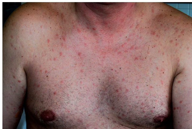
Fig. 1. Erythematous papular eruption on the trunk.

The most common infectious agents associated with cutaneous rashes (secondary syphilis, HSV 1–2, VZV,