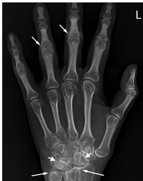
Fig. 2 BS-related radiological findings in a representative adult patient (38 years)

Diffuse peri-articular osteopenia and joint space narrowing in the PIP and wrist joints (short arrows). Dysplasia of the scaphoid and lunate bone (arrowhead). Associated biconcave radial epiphysis and abnormal plump distal ulna (longarrows) were typical of the Blau hand.