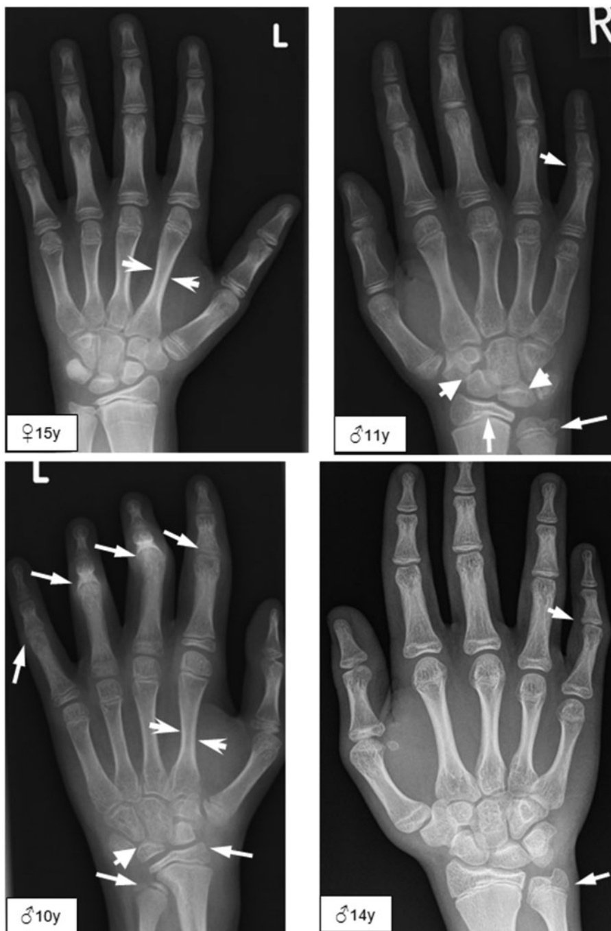
FIG. 3 BS-related radiological features in four children

Plain films of hands and wrists showing typical morphological changes including: (i) rotation and pseudo-collapse of the lunate and scaphoid bone (arrowheads in upper right and lower left panels); (ii) different grades of dysplasia of ulnar and radial epimetaphysis (biconcave shape) (long arrows in upper right and lower left panels); (iii) ulnar shortening, from subtle to severe grade (long arrows in upper right, lower left and lower right panels); and (iv) long and small diaphysis of the MC2 (sharp arrow in upper and lower left panels). Note the presence of osteopenia in hands and wrists. In one child, the PIP-contracture is present in four fingers (long arrows in lower left panel). In other children, camptodactyly and carpal dysplasia are more subtle.