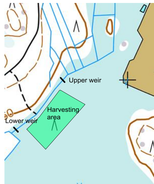
Figure 1. The schematic map of the study site.

Runoff (l s -1 ha -1 ), pH, suspended solids (SS), dissolved organic carbon (DOC) (mg l -1 ), total nitrogen (N tot ), ammonium-nitrogen (NH 4 + ), nitrate-nitrogen (NO 3 - ), total phosphorus (P tot ) and phosphate-phosphorus (PO 4 3- ) (µg l -1 ) concentrations were monitored at the study site during October 2009-October 2010. Runoff rates were measured using triangular Thomson's (90°) measuring weir (introduced by James Thomson first time in 1859) equipped with an automatic water level recorder allowing continuous measurements. The runoff rates were measured only below of the harvesting area (lower weir), and they were assumed similar to above of the harvesting area (upper weir) (Figure 1). Water samples were taken approximately biweekly from both upper and lower measuring weirs during summertime (May-October). During winter (November-April), water samples were taken ca. monthly if there was existing runoff.