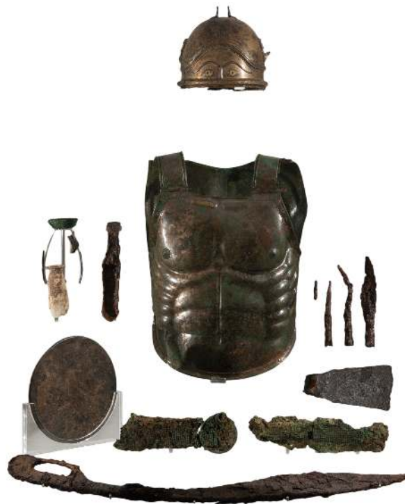
Fig. 1 Lanuvium, Funerary set of a warrior.

Athleticism and sport practice exercised a deep influence on the imagination of the Etruscan and Italic peoples for a long time. Therefore, during the Hellenistic period the number of products for body care increased significantly. For example, the diffusion of strigils reached high levels in funerary contexts. 4 Often realized in terracotta, they were used for their symbolic meaning rather than their practical function. Similarly, figurative decorations of candelabra, mirrors and fine pottery were inspired by athletic competitions and life in the palaestra. 5