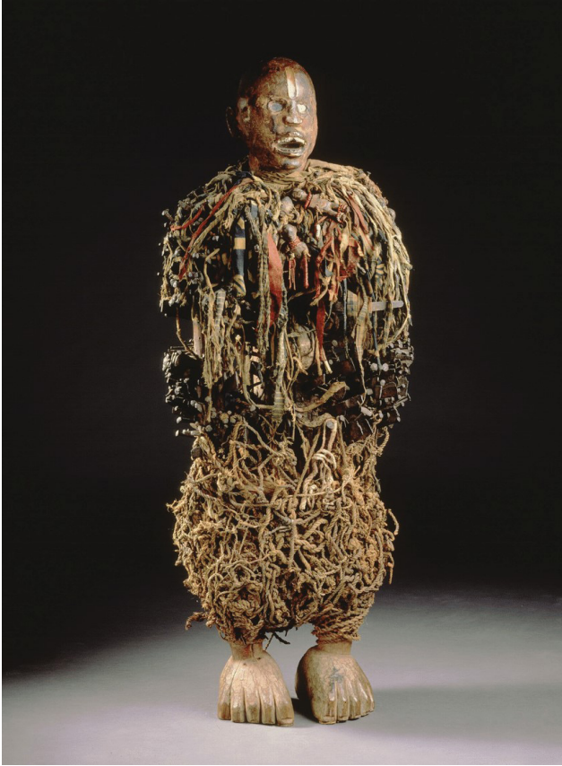
Illustration 4. EO.0.0.7943

and culture are best kept in museums for consultation by future generations. However, this fact does not constitute permission for European institutions to do nothing. Many objects were stolen, and many people do want their material culture and art returned, not only because these objects are of monetary worth, but also because of their inherent cultural value. That is why we need dialogue and positive cooperation, as well as more provenance research. Staff who can set new models in place are already present at Tervuren. Next to Couttenier's important work, I think of Hein Vanhee, historian and curator at the museum, and specifically of his 2016 article in African Arts , 'On Shared Heritage and Its (False) Promises'. This kind of constructive research is essential to museum work. With the reopening, the Africa Museum in Tervuren, and more broadly, Belgium, has a chance to take action and thoroughly research its collection. Only then will it be able to transform its careful blueprint of a decolonized museum into a more ambitious and successful exercise.