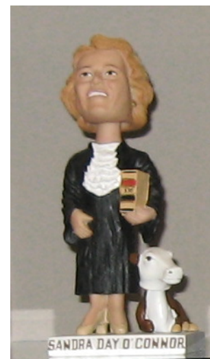
Justice Sandra Day O'Connor