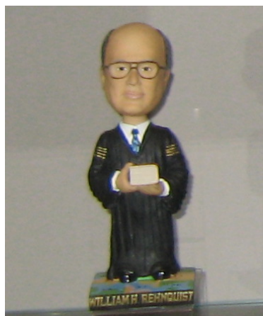
Justice William Rehnquist