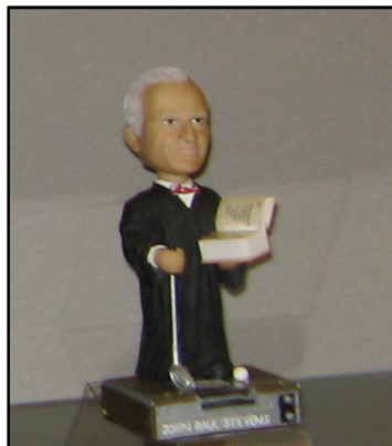
Justice John Paul Stevens