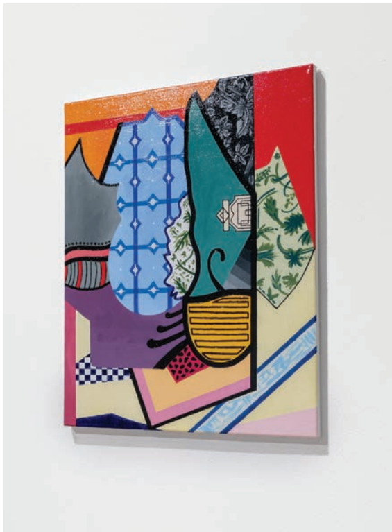
Off Switch , 2019 Acrylic on canvas 18 x 24 inches