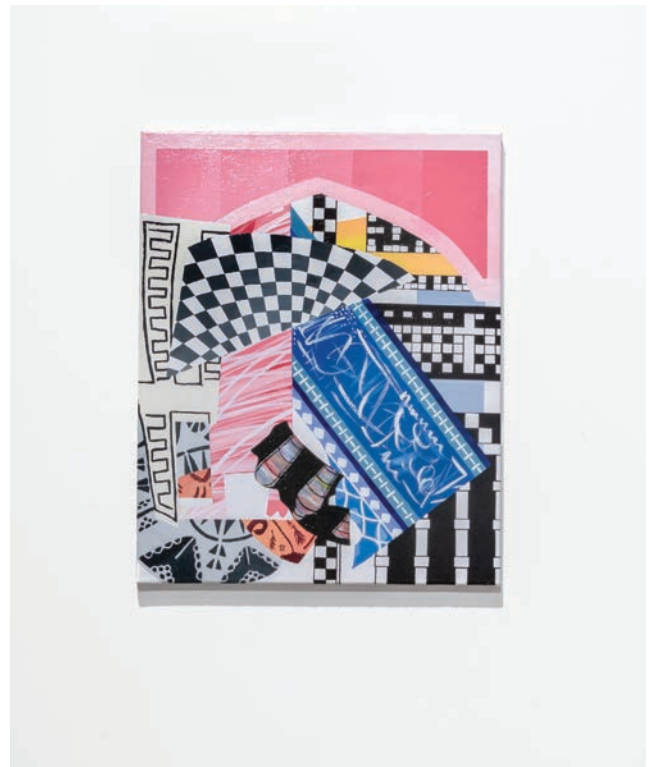
Overloaded , 2019 Acrylic on canvas 18 x 24 inches