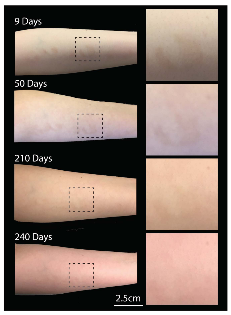
Figure 2. Case example of postinflammatory hyperpigmentation. Case subject reported persistent skin pigmentation that was first noticed 9 days after end of experiment. Subject showed pigmentation on both the left and right (not shown) forearms on all 3 stimulation sites per arm. Dotted box is centered on the same stimulation site for photographs taken on days 9, 50, 210, and 240 after the end of the experiment. Dotted box area is enlarged to the right of each image to show example hyperpigmentation and the gradually lightening of hyperpigmentation with time.

240 days after testing and without any therapeutic interventions, dark macules had faded to visible but near-normal pigment macules.