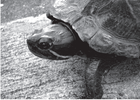
Figure 2. A captured Trachemys scripta elegans .