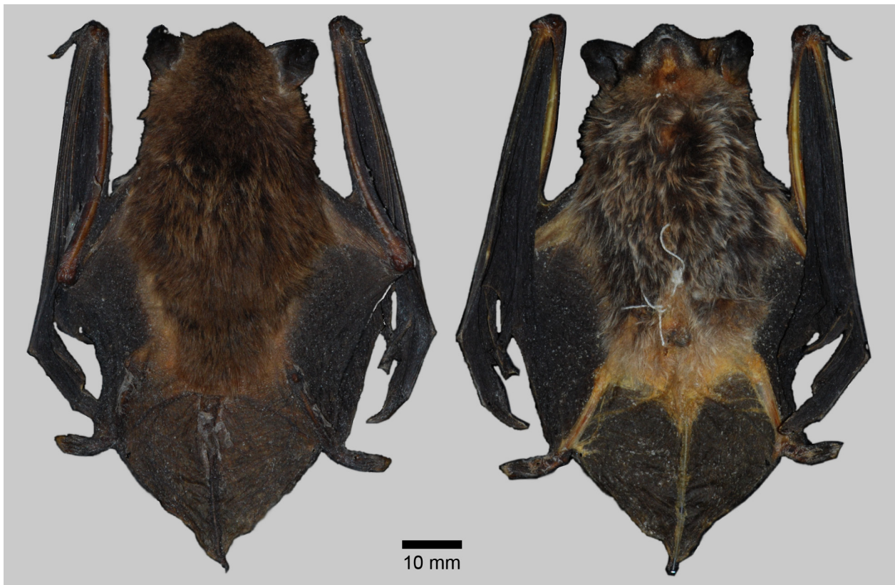
Figure 2. Eptesicus brasiliensis argentinus skin. Dorsal and ventral views of the skin of specimen CML 11965 of E. b. argentinus .

with high agricultural and urban development, especially in the province of Entre Ríos, where deforestation has recently been intensified by the rapid expansion of soybean crops and eucalyptus plantations (Arturi 2006). The collection area is a patch of natural vegetation, surrounded by crops.