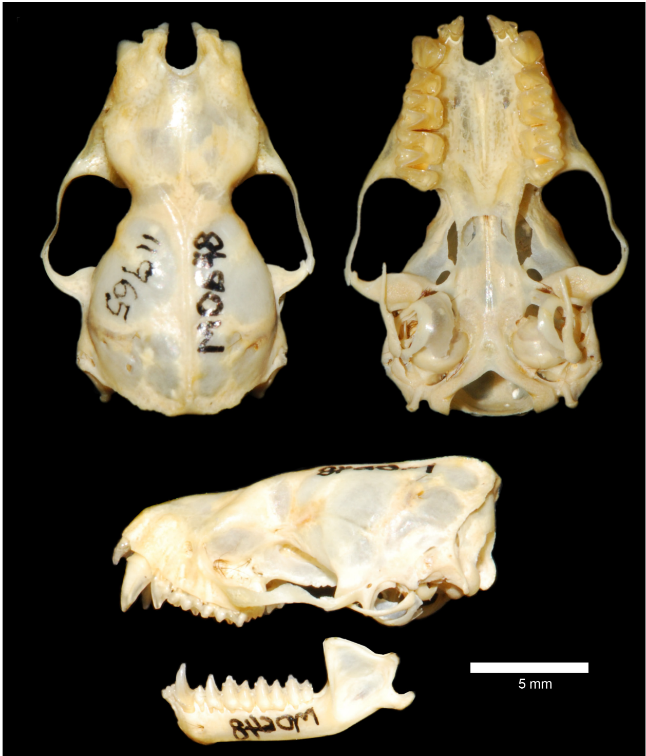
Figure 3. Eptesicus brasiliensis argentinus skull and mandible. Dorsal, ventral and lateral views of the skull and lateral view of the mandible of the specimen CML 11965 of E. b. argentinus .

coloration with reddish tones, with hairs dark at the bases but with light tips; the slight contrast between dorsal and ventral coloration is also notable. Eptesicus b. argentinus cohabits in Argentina with 2 other species of the genus and differs from them mainly by size (Table 1), being the largest species with a forearm greater than 41 mm, while in E. furinalis is less than 41 mm and in E. diminutus is less than 37 mm. A fourth species occurring in Argentina, E. chiriquinus , is similar in size to E. b. argentinus , but both are morphologically quite different and their distri-